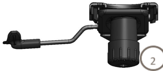
Front view (as facing chair)