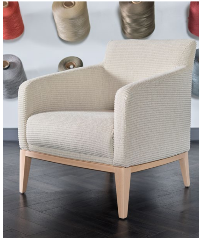
Elide lounge seating