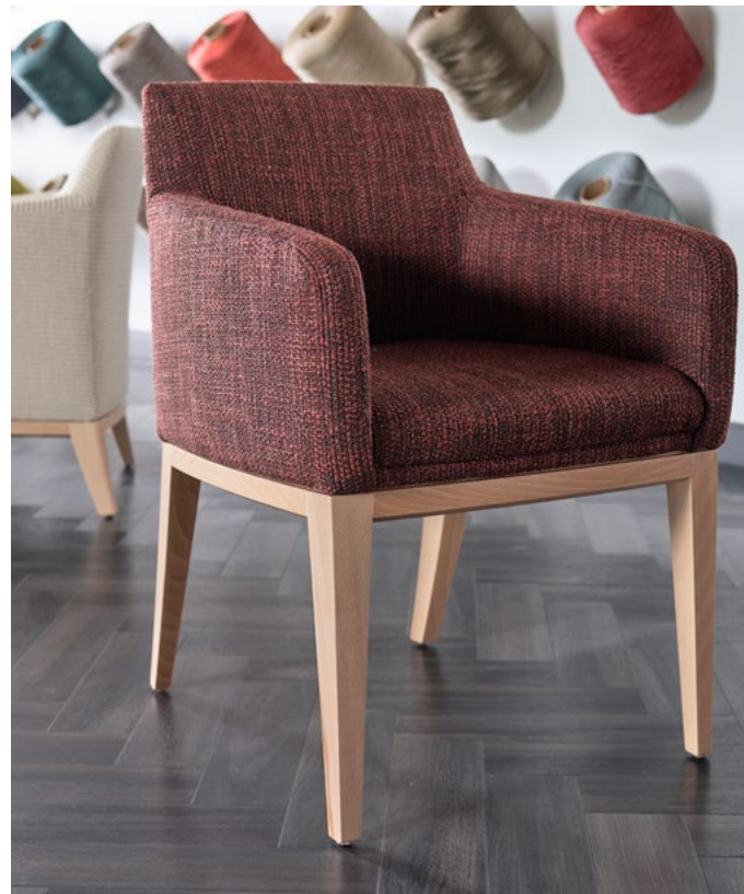
Elide cafe/dining seating