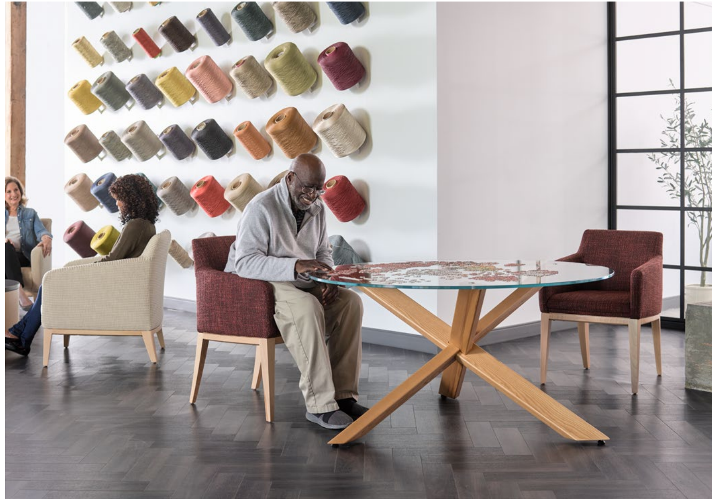
Elide cafe/dining & lounge seating with Beck cafe/dining table by OFS