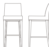
Bar stool C9557B - single textiles C9557B-MT - multiple textiles w18" d19" h42"