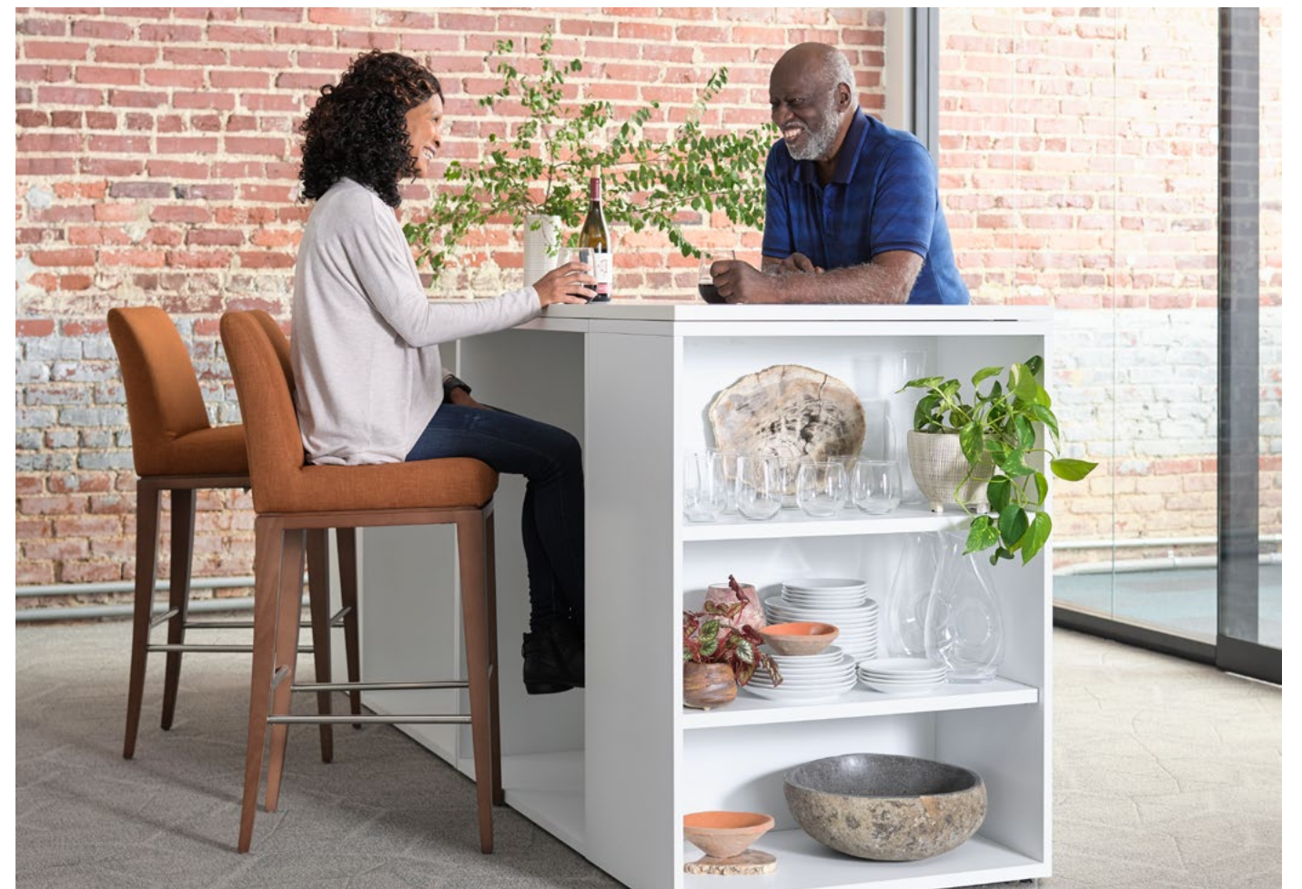
Elide bar stool seating