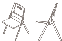
Plastic seat and back, folding chair 1100-PL w19.5" d23.75" h34"