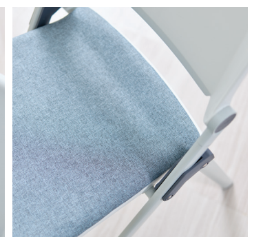
Upholstered seat for additional comfort