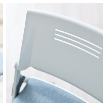
Vented plastic for additional comfort