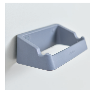
Wall hanging bracket for storage when not in use