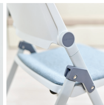
Durable metal frame available in Bone White or Chalk