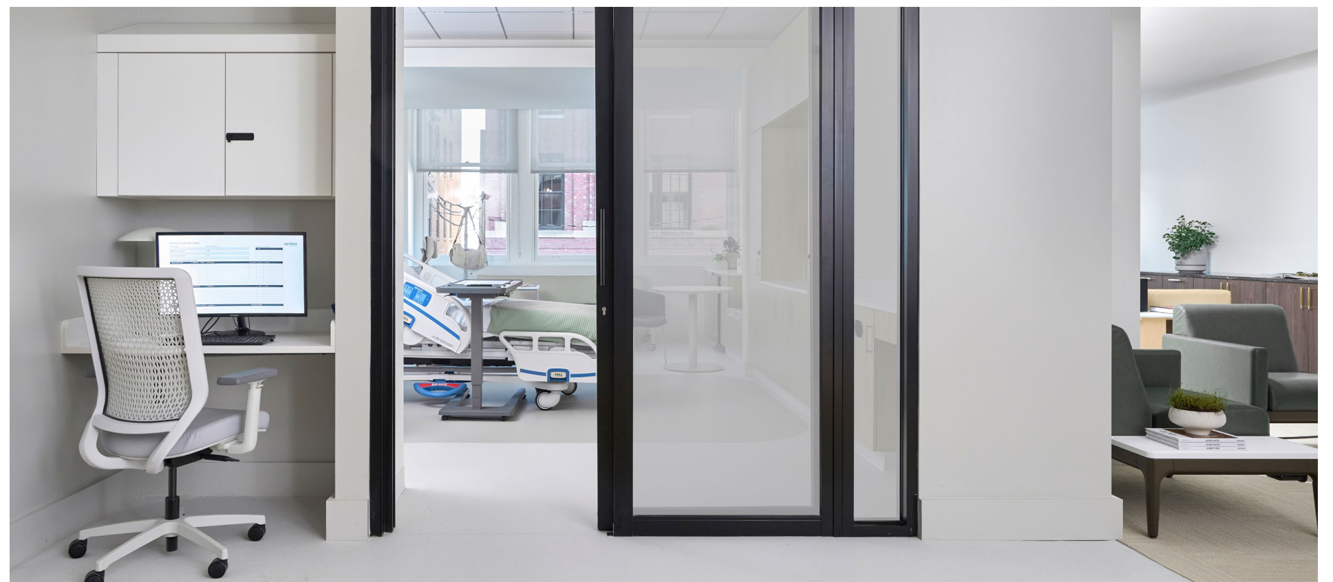
Decentralized nurse station