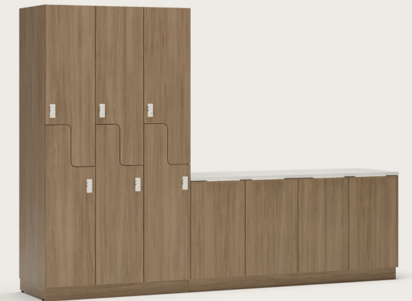
Cabinetry Z locker and base cabinet with waste pullout Pull Awe | Lock Keyless1 mechanical lock