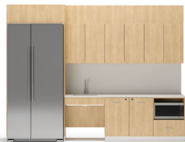
Staff respite, café & dining