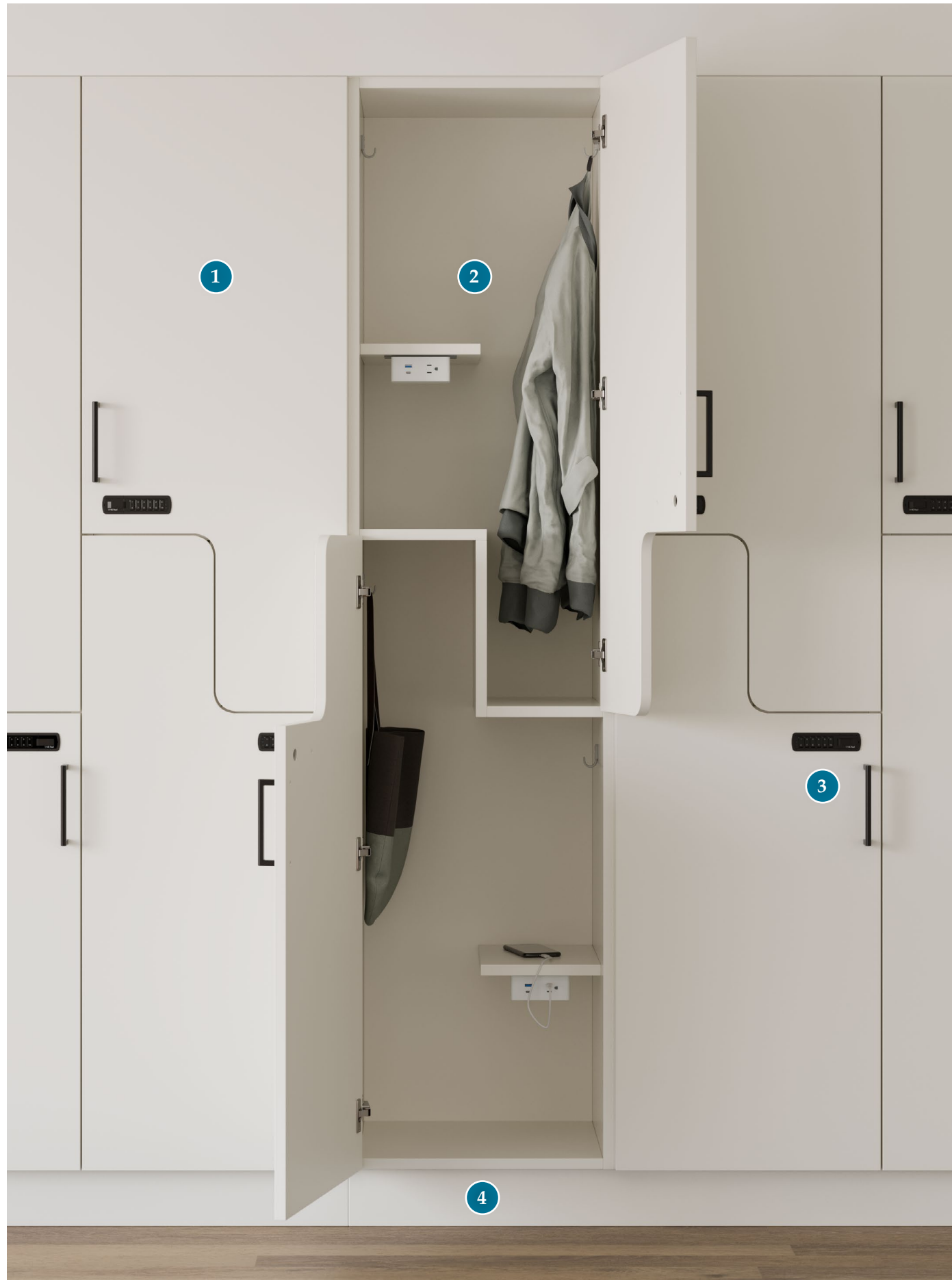
Cabinetry Z locker | Pull Myle | Lock Pearl electronic lock