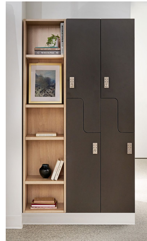
Cabinetry Z locker and storage Lock Keyless1 mechanical lock