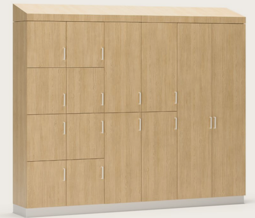
Cabinetry 2 door, 4 door lockers, and storage Pull Era