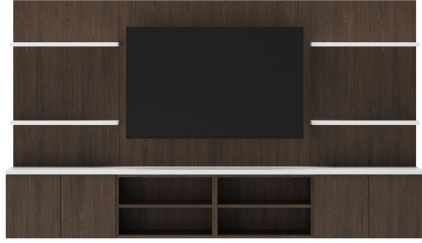
Learning, shared & training spaces