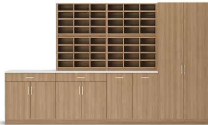
Community & team spaces