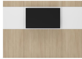
Learning, shared & training spaces