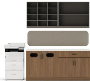
Community & team spaces