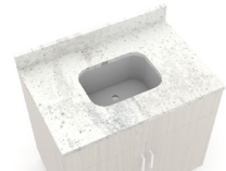
DRS4 Integral 7.5" deep