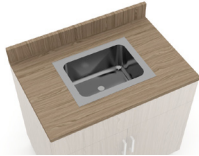
DRS2 Drop-in 7.5" deep with overflow