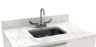
B5R Paddle handle 3.5" gooseneck