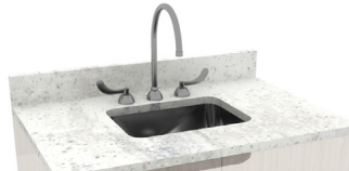
HND3 Paddle handle 8" gooseneck