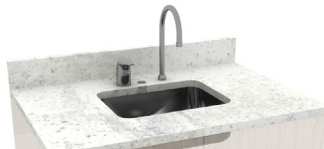
HND1 Single handle 5.75" gooseneck