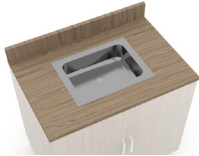
B5P / DRS1 Drop-in 4.5" deep / with overflow