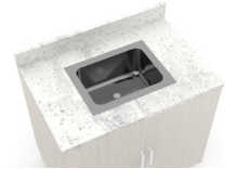
DRS2 Drop-in 7.5" deep with overflow