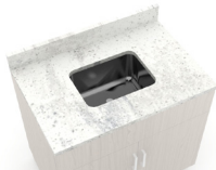
UMS2 Undermount 7.5" deep with overflow