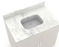
B5K / DRS3 Integral 4.5" deep / with overflow