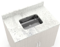
B5M / UMS1 Undermount 4.5" deep / with overflow