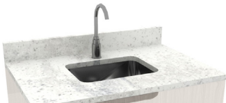
B5S Sensor 5.25" gooseneck