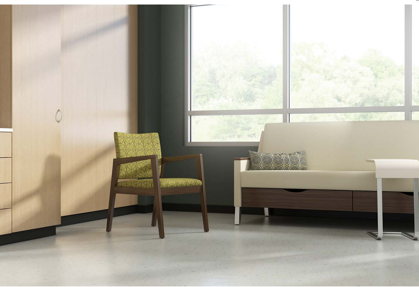
Rein+ easy access seating with Mile Marker cabinetry