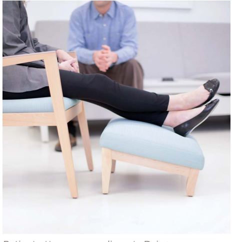
Patient ottoman compliments Rein+ patient seating