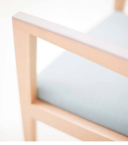
Arm caps available in resin and solid surface; grey resin shown