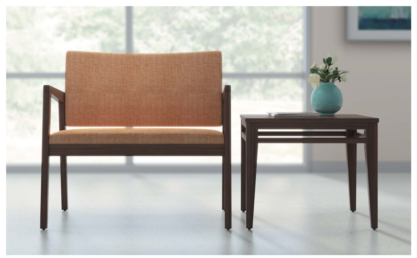
Rein+ bariatric seating and occasional tables