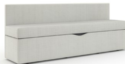
76" High back sleepover bench with upholstered trundle front