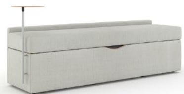
68" Sleepover bench with upholstered trundle front and HPL tablet