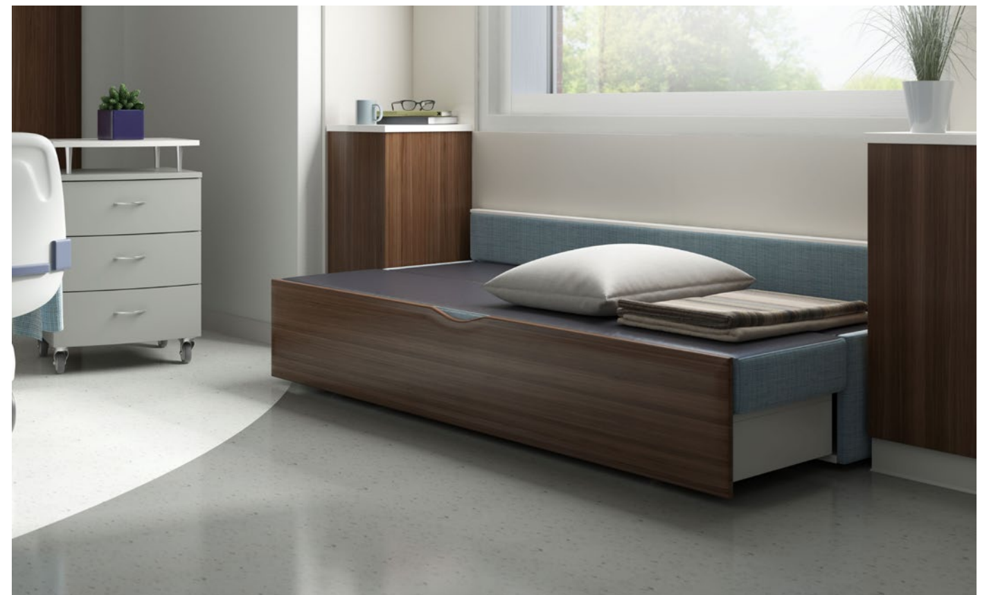
Whisper 68" sleepover bench with Senso bedside cabinet