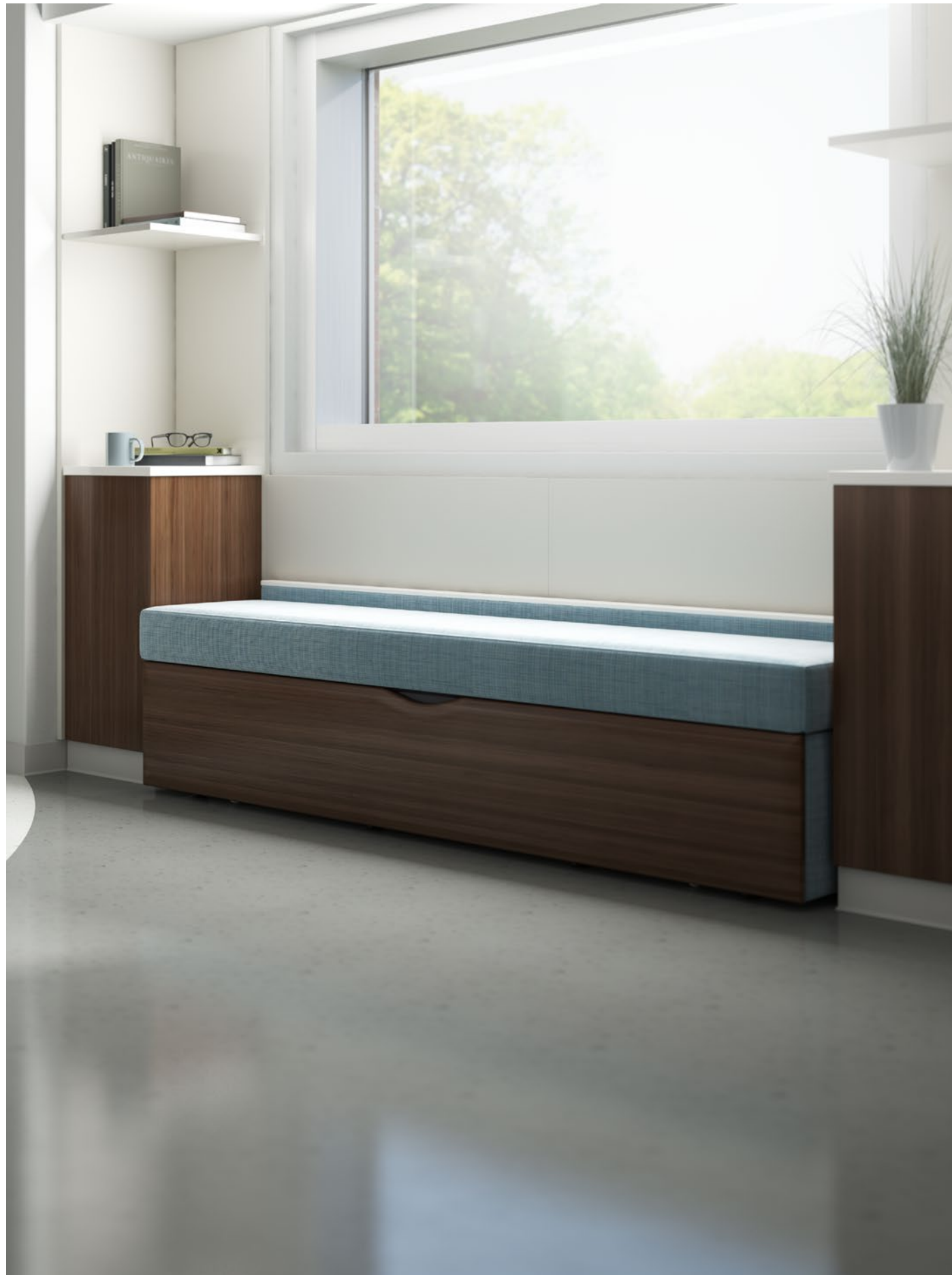
Whisper 68" sleepover bench with upholstered seat and 3DL trundle front