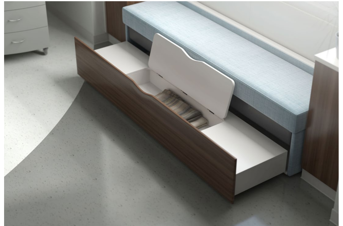
Whisper 68" sleepover bench standard storage compartment