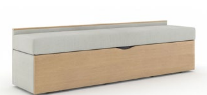
76" Sleepover bench with 3DL trundle front