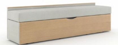
76" Sleepover bench with 3DL trundle front