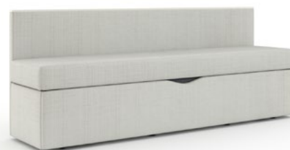
76" High back sleepover bench with upholstered trundle front