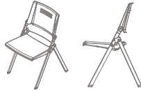
Upholstered seat and plastic back, folding chair