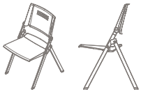
Plastic seat and back, folding chair