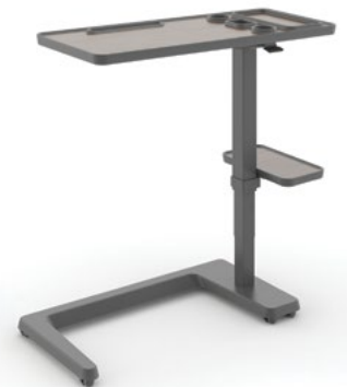
HPL top, C base