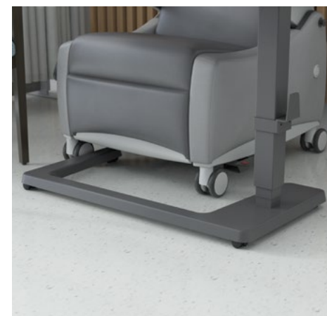
Low profile, dark grey powder-coated steel column and C base