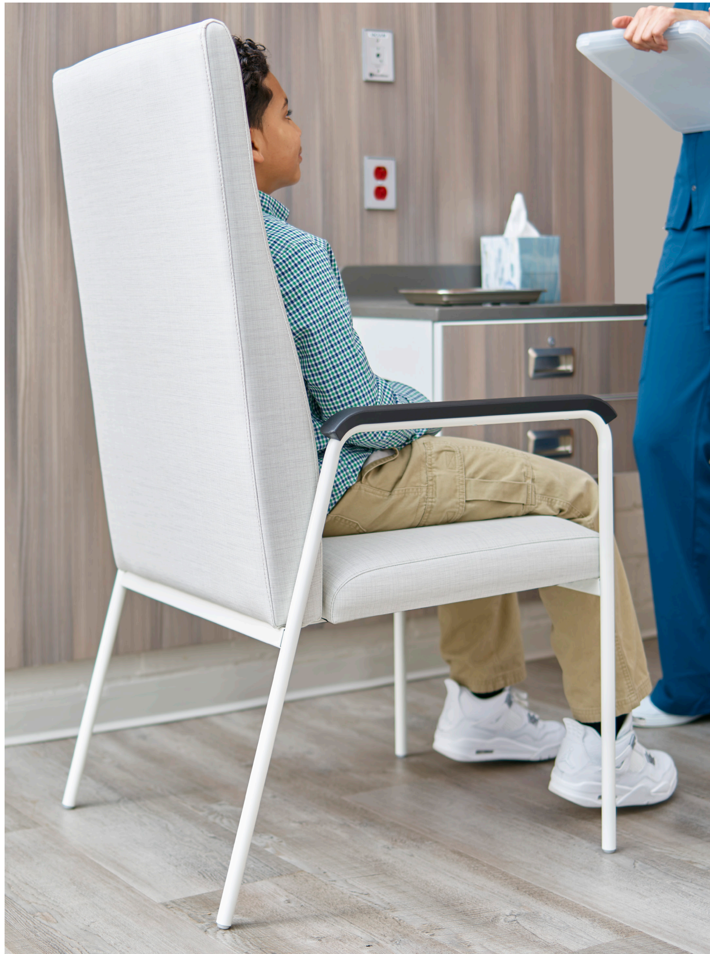
Rule of Three patient seating featuring black resin arm caps with Mile Marker casegoods