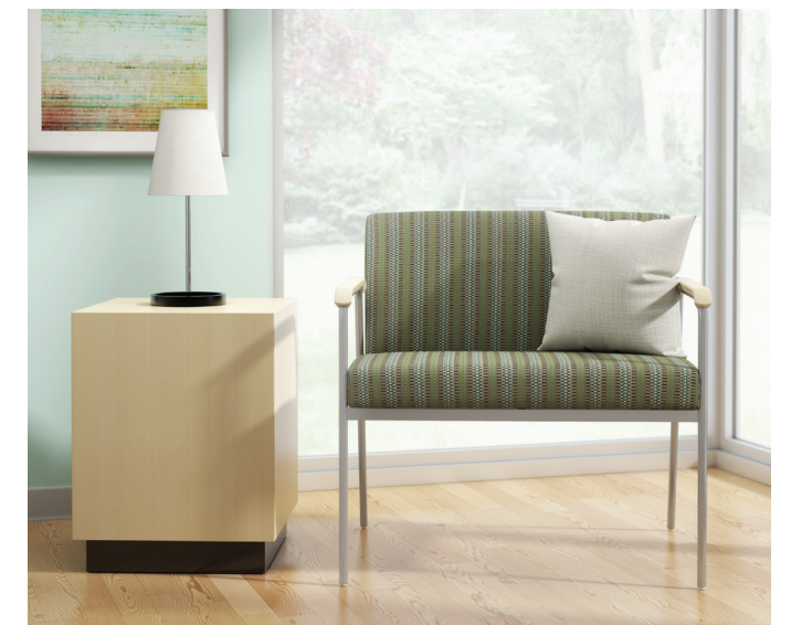
Rule of Three bariatric seating with wood arm caps and X&O occasional tables