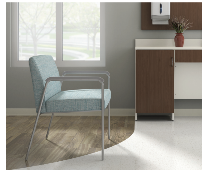
Rule of Three guest seating with folkstone grey resin arm caps