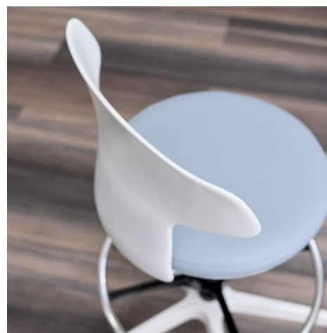
Back and seat available in Carbon Graphite, and Chalk