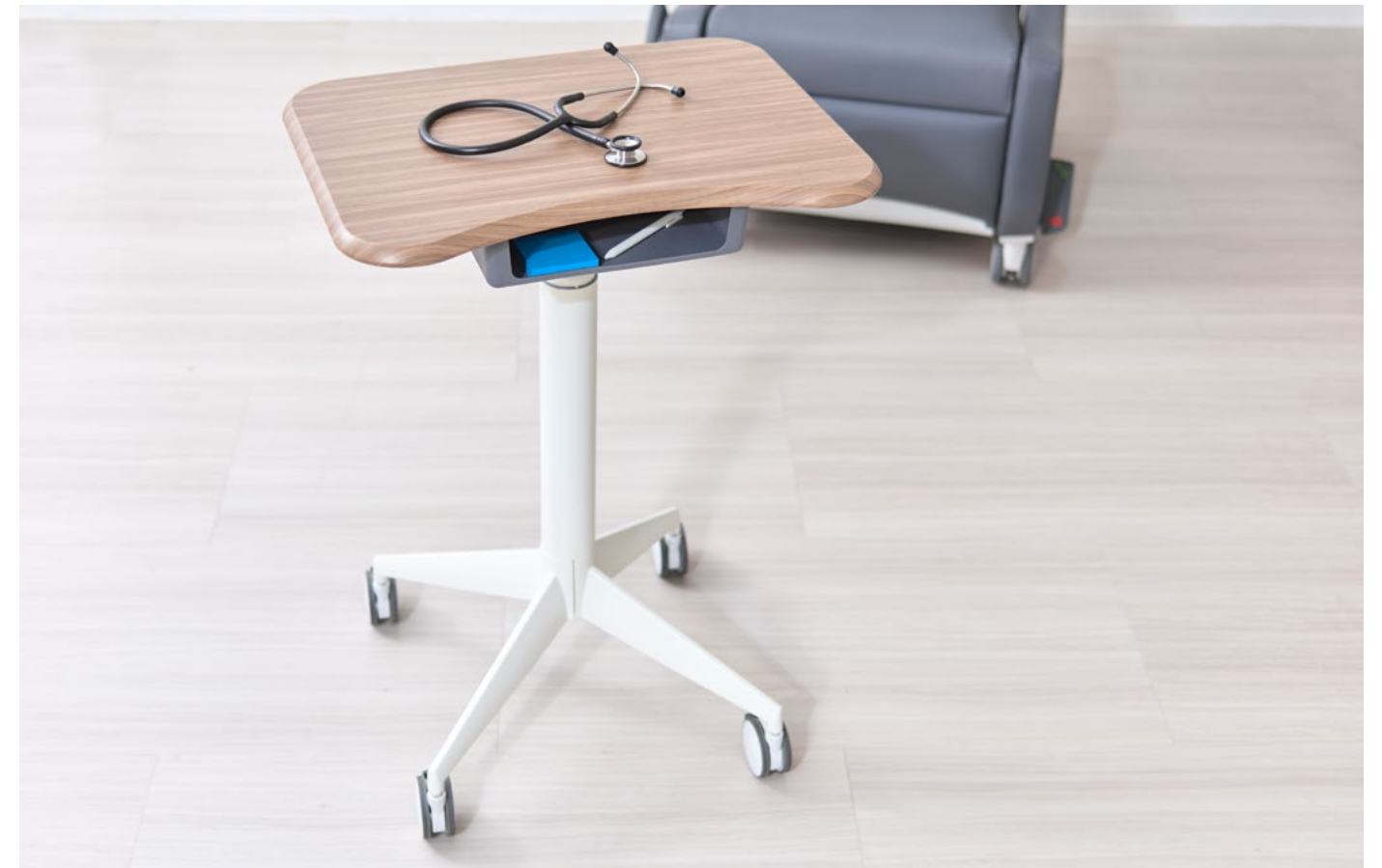
Stray mobile table with storage cubby