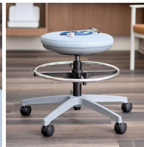
Optional footing available on all physician's stools