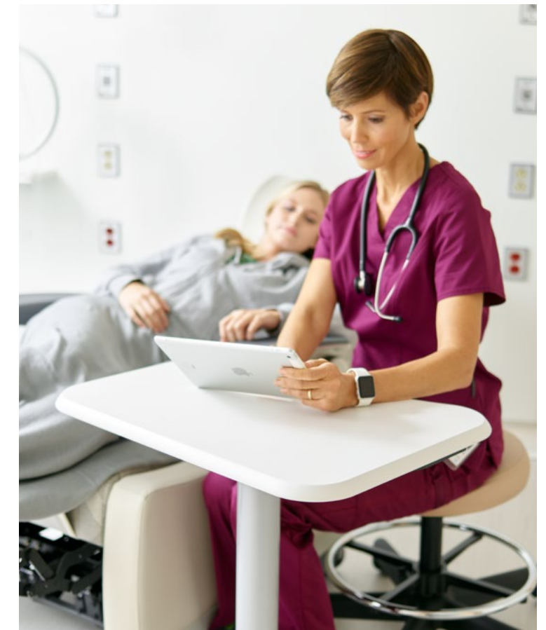
Top is available in standard 3DL finishes