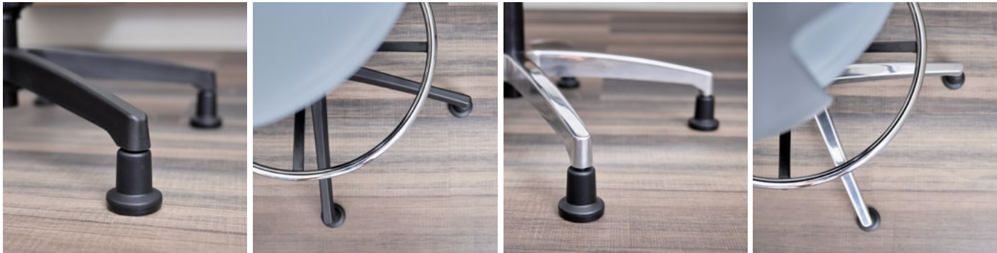
Optional black glides Nylon base shown in Carbon Base shown in Polished Aluminum with optional black glides Polished aluminum foot ring