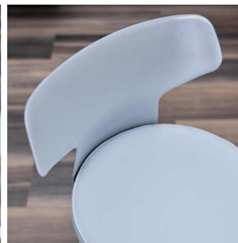
Lab stool with back shown in Graphite