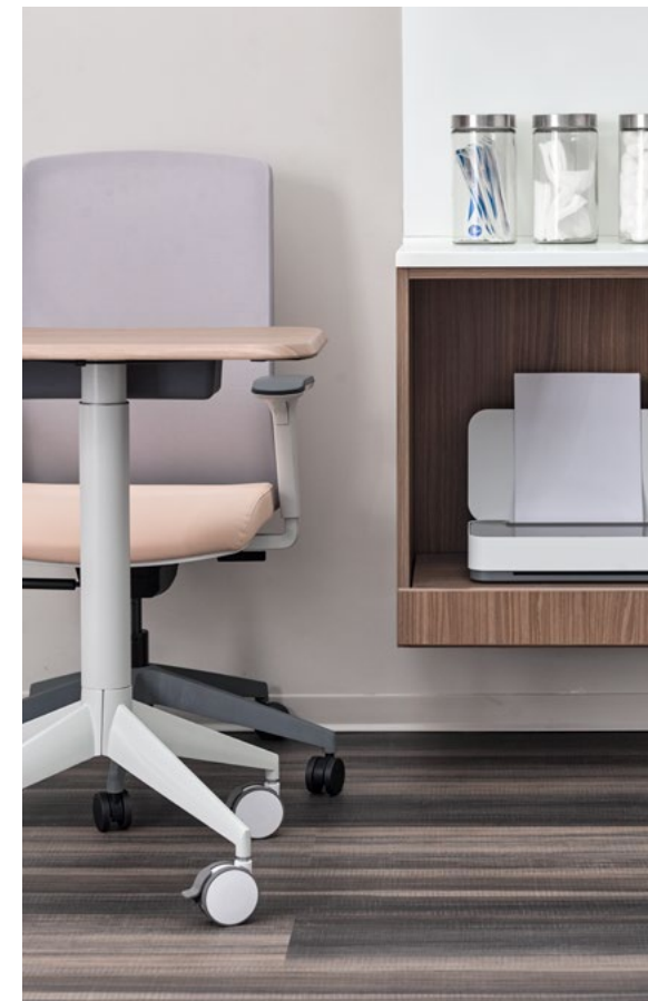
Stray mobile table with Mile Marker cabinetry and Zonal by OFS