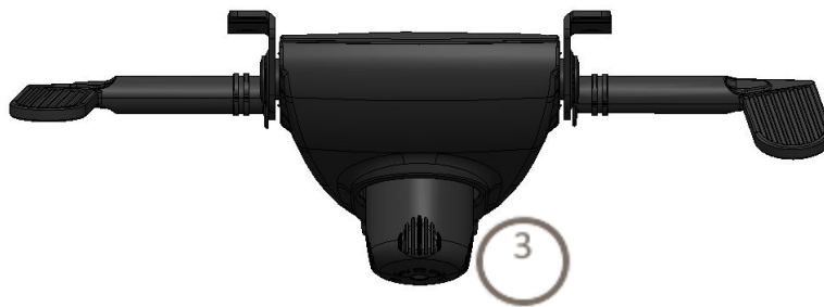
Front view (as facing chair)