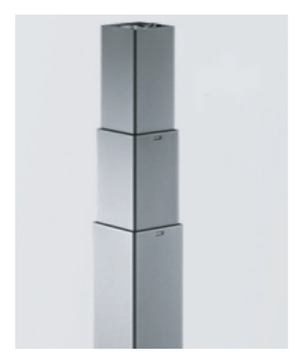
Lifting column: dl17