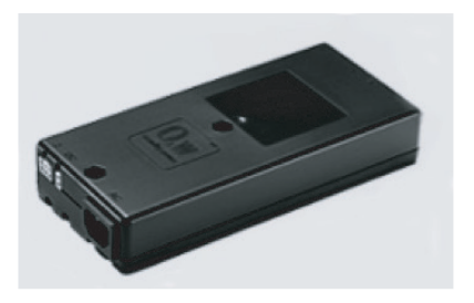
Control box: cbd6s