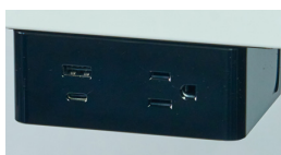
PS-115W PS-115B one AC socket and one USB A + C