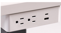
PS-116W PS-116B two AC sockets and one USB A + C