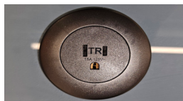
PS-114W PIP PS-114B PIP One AC socket