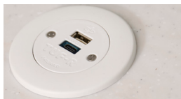
PS-113W PIP PS-113B PIP One USB A + C