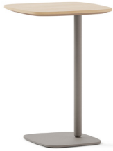
211-V1919S veneer (shown) 211-T1919S TFL or HPL 211-S1919S solid surface