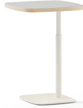
211-V1919P veneer (shown) 211-T1919P TFL or HPL 211-S1919P solid surface