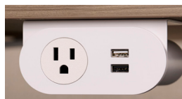
PS-2UM Boone One AC receptacle and two USB-A ports