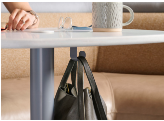
211-AH for use with TFL, HPL, veneer and glass top 211-SAH for use with solid surface top