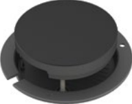
Wireless charging unit