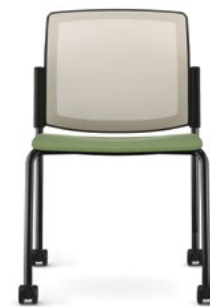
Multi-use chair with mesh back, armless