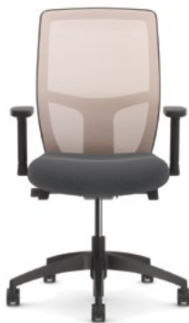
High back task with black nylon base