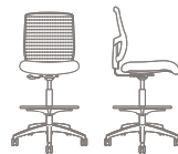
Mid back, bar stool 1519 w27.5" d27.5" h43.75-56.25"