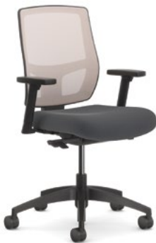
Mid back task with black nylon base