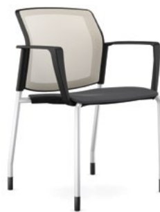
Multi-use chair with mesh back and arms