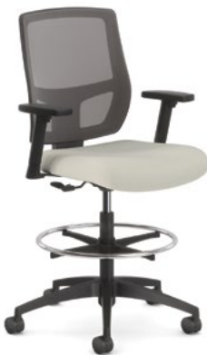
Stool with black nylon base