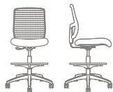
Mid back, counter stool 1519 w27.5" d27.5" h40-49.75"