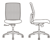
High back 1510 w27.5" d27.5" h38.5-44.75"