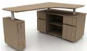
Veneer- 68"w desks standard panel base, no column base