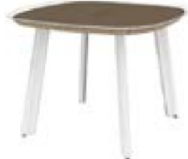
42x42 shown on 34-DFC duofoil legs