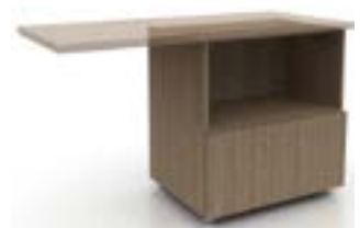
30"w or 36"W