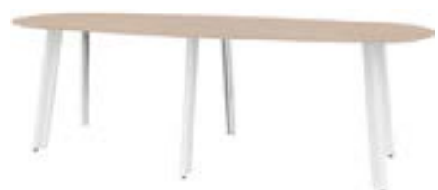
36x96 shown with six 34-DFC duofoil legs