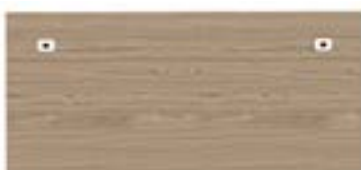
Plan view optional left and right grommets