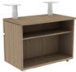
30"w exterior side