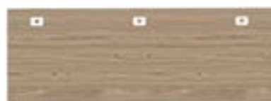
Optional left, center, and right grommets shown