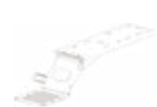
Keyboard arm KBA-1