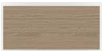
Rectangular Veneer only