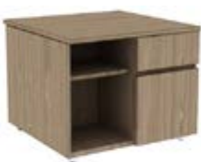
Reference for 30" w and 36" w