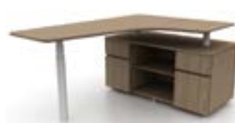
Veneer - 74"w desks standard column base, optional panel base