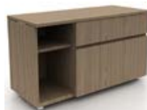
Open shelving and lateral