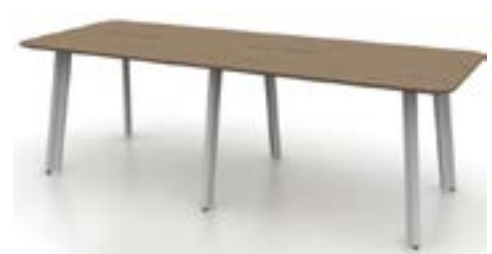
36x96 shown with six 34-DFC duofoil legs