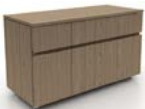
Box/lateral and box/file