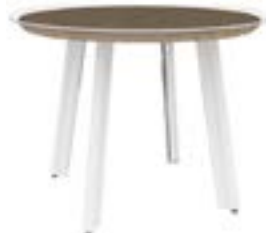
42" dia.. shown on 34-DFC duofoil legs