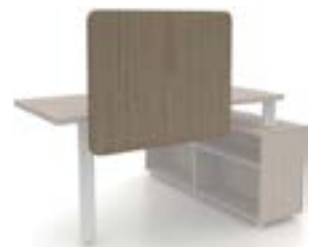
Veneer for 48" applications