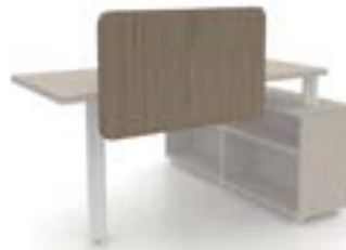
Veneer for 42" applications