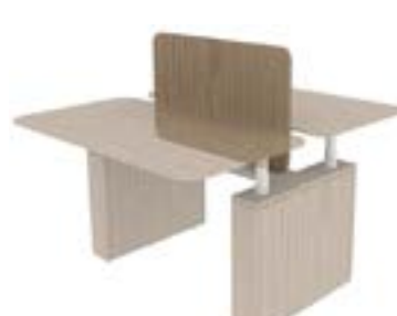
Veneer for 42" applications