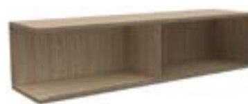
One sliding glass door