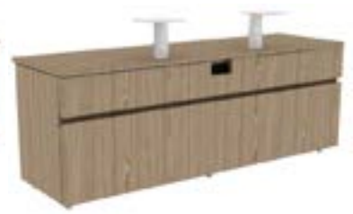
60"w interior side