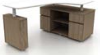
Solid surface - 68"w desks standard panel base, no column base