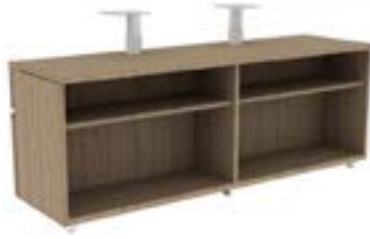
60"w exterior side