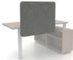
Fabric for 48" applications