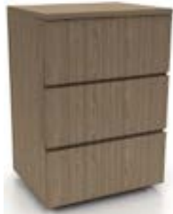
3 Drawer lateral