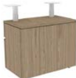
Optional finished back for 18"d only