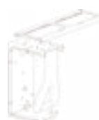
CPU holder CPUH-1