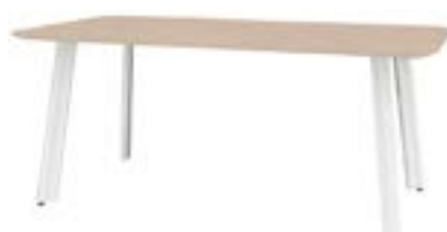
36x72 shown with four 34-DFC duofoil legs