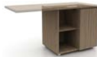
Open/door right hinged door shown