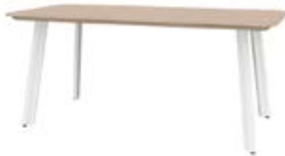
36x72 shown with four 34-DFC duofoil legs