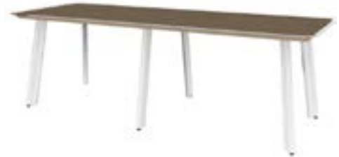
36x96 shown with six 34-DFC duofoil legs