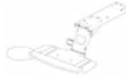
Keyboard tray KBA-3