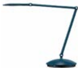
Double arm table top base