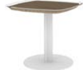
30x30 on 34-TFP trifoil base