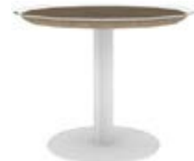
30" diam. on 34-TFP trifoil base