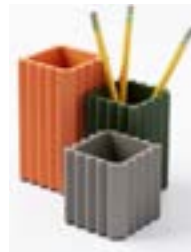
LCA-NSV1 Earth shown