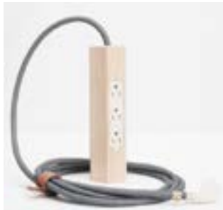
Power strip PS-3AC