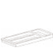
Pencil tray DA18-1 / DA14-1