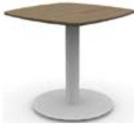
30x30 on 34-TFP trifoil base