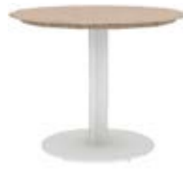
30" diam. on 34-TFP trifoil base