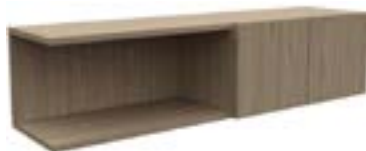
Two hinged doors