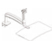
Monitor/keyboard arm single arm shown MKA-1S_