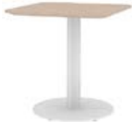
30x30 on 34-TFP trifoil base