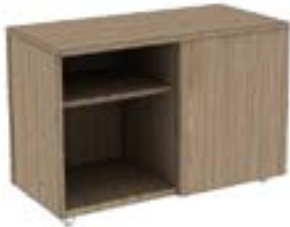
30" w shown