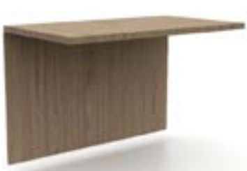
Finished back panel