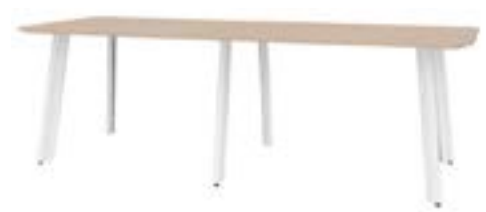
36x96 shown with six 34-DFC duofoil legs