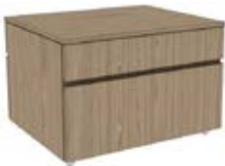
Reference for 30" w and 36" w