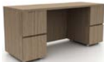
Four file drawers