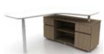
Solid surface - 74"w desks standard column base, optional panel base