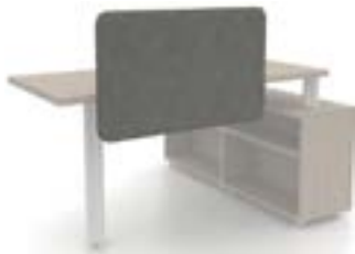
Fabric for 42" applications