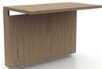
Optional hinged back panel