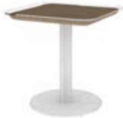
30x30 on 34-TFP trifoil base