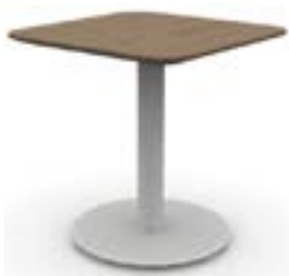
30x30 on 34-TFP trifoil base