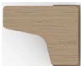
Plan view 68x54