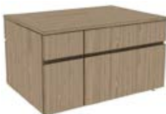
Reference for 42" w-54" w