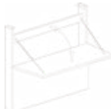
Optional hinged access panel