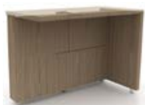
Fold down back panel