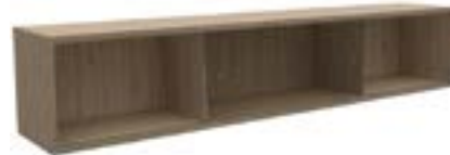
Center sliding glass door with open end sections