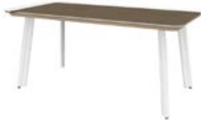
36x72 shown with four 34-DFC duofoil legs