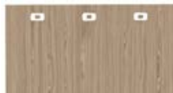
Plan view Center grommet standard. optional left and right grommets