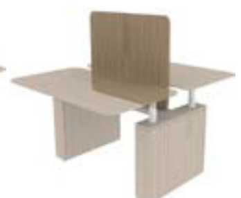
Veneer for 48" applications