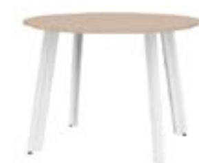
42" dia.. shown on 34-DFC duofoil legs