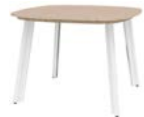
42x42 shown on 34-DFC duofoil legs