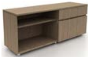
Wide open shelving, lateral