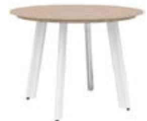
42" dia.. shown on 34-DFC duofoil legs