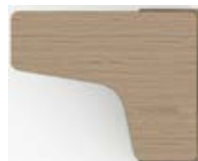
Plan view 74x60