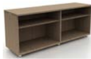
Wide double open shelving