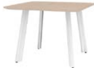
42x42 shown on 34-DFC duofoil legs