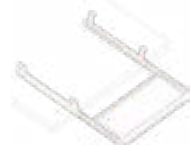
Wood keyboard tray WK/S