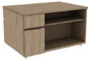
Reference for 42" w-54" w