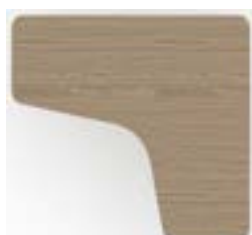
Sweep left hand