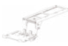
Keyboard arm KBA-2