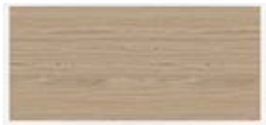
Long grain - for modular desk top and worksurface height cabinet top