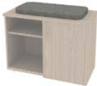
Reference for 29x14 and 35x14