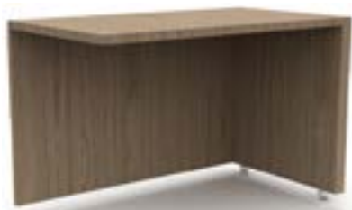
Finished back panel