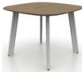
42x42 shown on 34-DFC duofoil legs