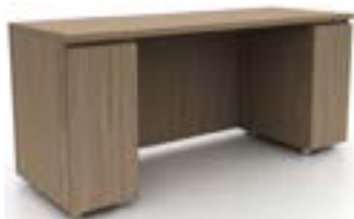
Two slide out storage