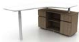
Solid surface standard column base, optional panel base