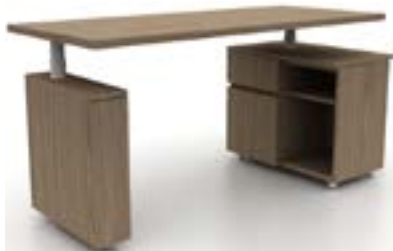
User side, 18"d