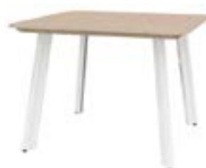
42x42 shown on 34-DFC duofoil legs