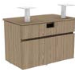
30"w interior side