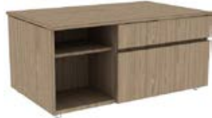
Reference for 42" w-54" w