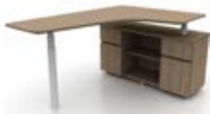
Veneer standard column base, optional panel base