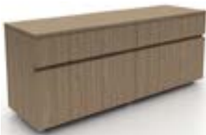
Double lateral file