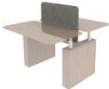
Fabric for 42" applications