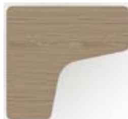
Sweep right hand