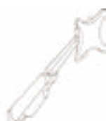
Double arm MA-1D