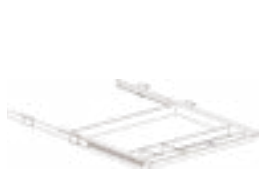
Pencil drawer PD-1