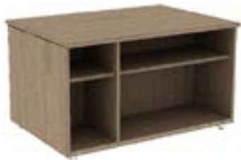
Reference for 42" w-54" w