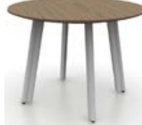
42" dia. shown on 34-DFC duofoil legs