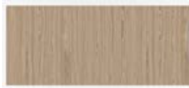
Short grain - for worksurface height cabinet top