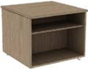
30" w shown