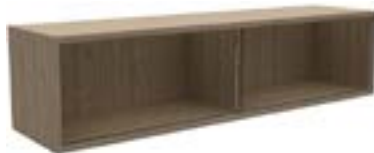
Two sliding glass doors