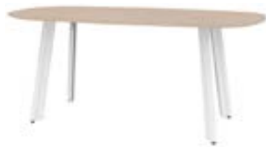
36x72 shown with four 34-DFC duofoil legs