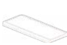
Wood tray WKT