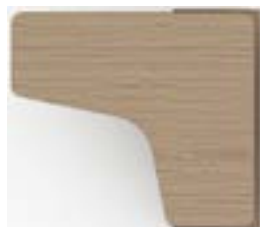
Plan view 68x60