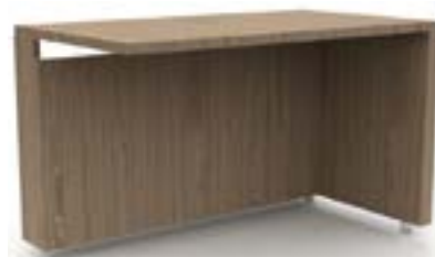
Optional hinged back panel