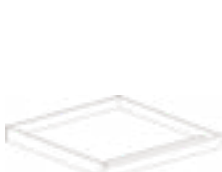
Center drawer OCD/OCD1