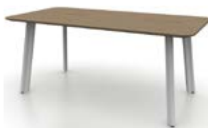
36x72 shown with four 34-DFC duofoil legs