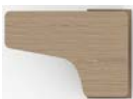
Plan view 68x48