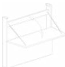
Lateral and multi file optional hinged access panel