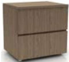
2 Drawer lateral