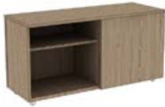
60" w shown