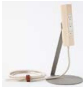
Power strip with base PS-3ACS