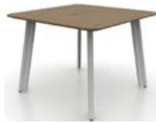
42x42 shown on 34-DFC duofoil legs