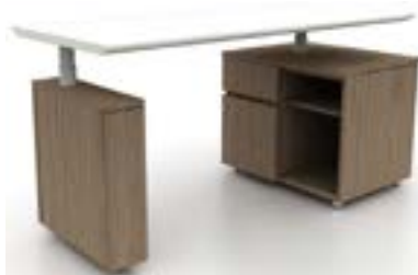
User side, 24"d