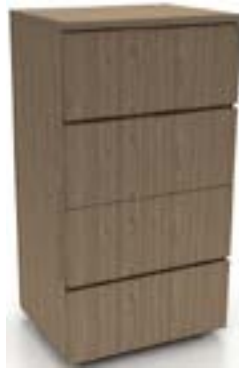
4 Drawer lateral