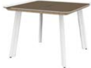
42x42 shown on 34-DFC duofoil legs