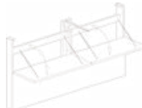
Optional hinged access panel