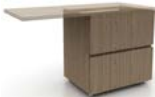
30"w or 36"W