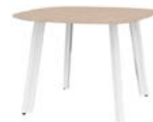
42x42 shown on 34-DFC duofoil legs