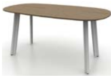
36x72 shown with four 34-DFC duofoil legs