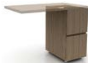
15"w or 18"w