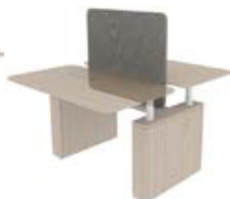
Fabric for 48" applications