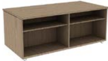
60" w shown