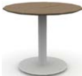
30" dia. on 34-TFP trifoil base