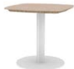
30x30 on 34-TFP trifoil base