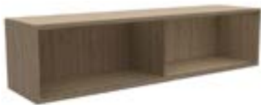
One sliding glass door