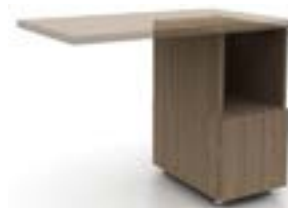
15"w or 18"w