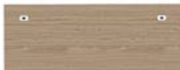
Plan view optional left and right grommets