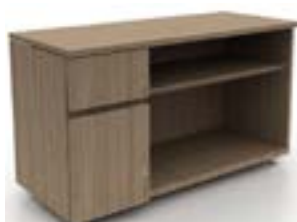
Box/file and wide open shelving