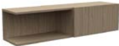
One lift up door