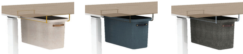
Tan tote, Natural strap, Black rivets, Turmeric rail