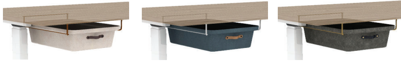
Tan tote, Chocolate strap, Black rivets, Rust rail