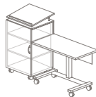
Height adjustable teacher station with AV lectern ED1-6622AVTDL ED1-6622AVTDR w66" d22" h43.75"