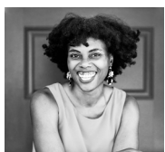
Two Inches Beyond Black