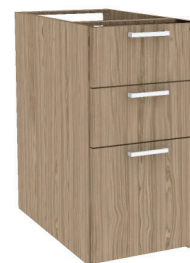
Box/box/file Q-EL-1628MBFC Q-EL-1620MBFC