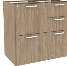
Multi file, left Q-EL-3120MMFL