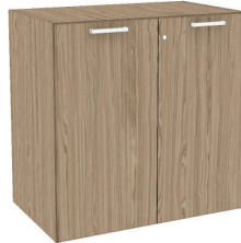
Hinged door CPU Q-EL-3120MPCPU/D