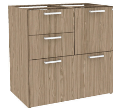
Multi file, right Q-EL-3120MMFR