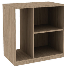
Open CPU Q-EL-3119MPCPU