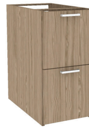
File/file Q-EL-1628MFFC Q-EL-1620MFFC