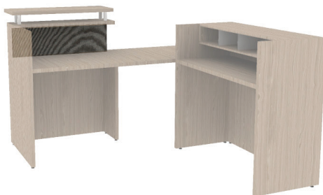
Open L desk