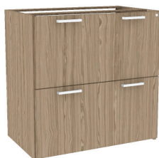
Lateral file Q-EL-3120MFC