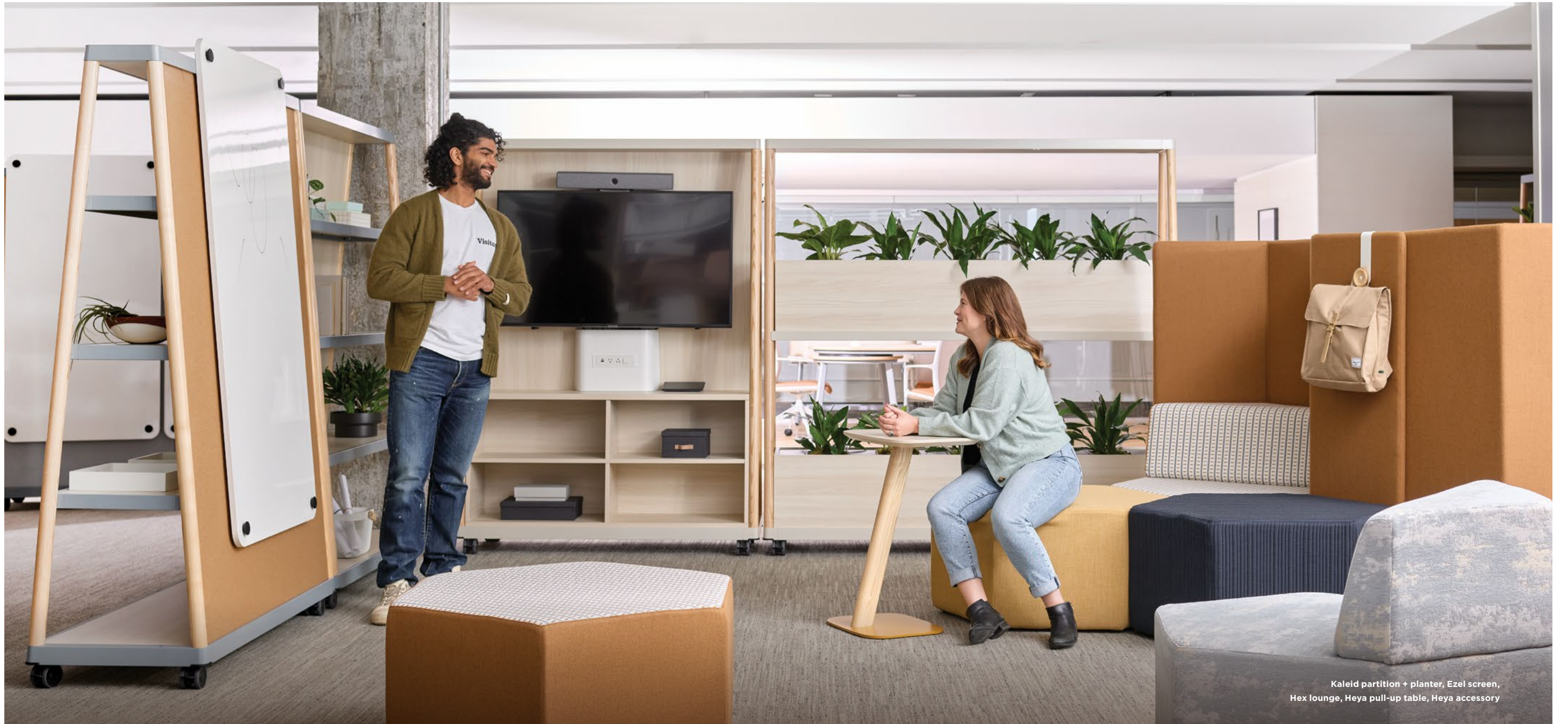
Kaleid partition + planter, Ezel screen, Hex lounge, Heya pull-up table, Heya accessory