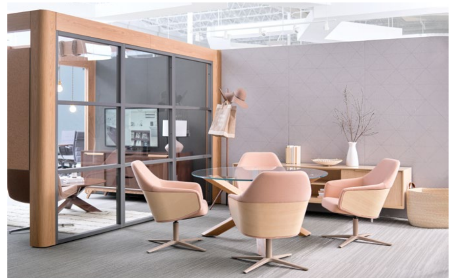
Above: Obeya architectural structure, Mention lounge + ottoman, Pret task, Kasura guest, Beck table, credenza, + occasional, Rowen credenza