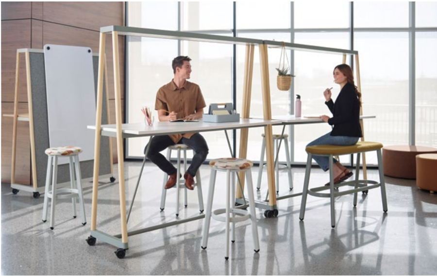
Above: Obeya architectural structure, Kaleid partition, The Edge lounge, Kaleid workstation, Ezel screen, Fleet stool, Boost ottoman, Coop organizer Left: Fleet table with canopy