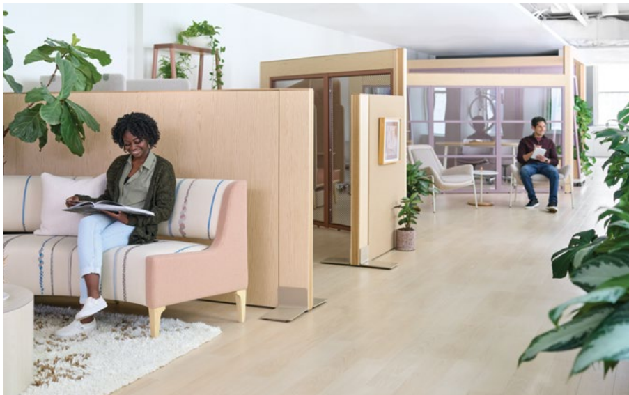
Above: Obeya architectural structure, Applause table, Butterfly executive, Ezel screen, Basil modular lounge, Sofy lounge, Strap occasional Left: Kaleid partition + planter, Fleet table, Genus task, Obeya architectural structure