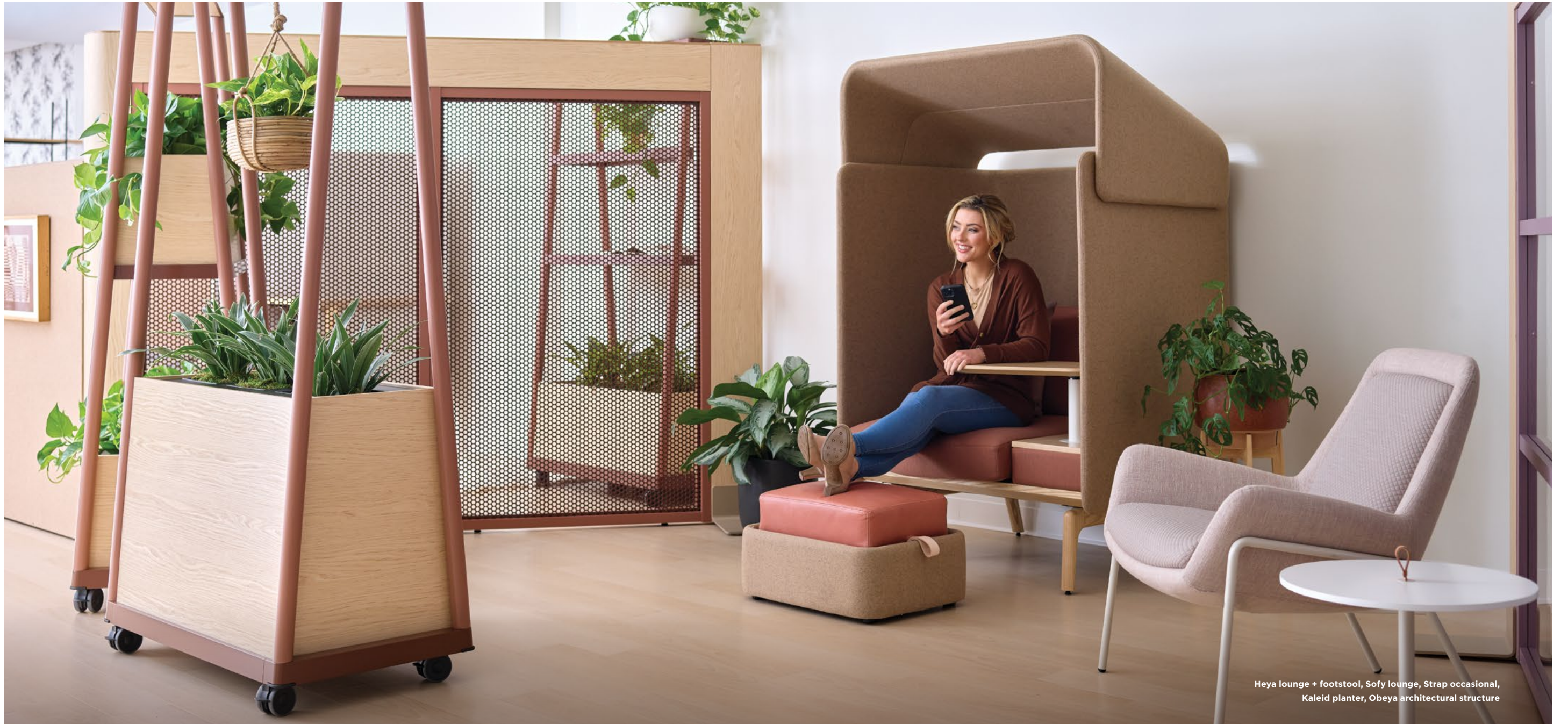
Heya lounge + footstool, Sofy lounge, Strap occasional, Kaleid planter, Obeya architectural structure