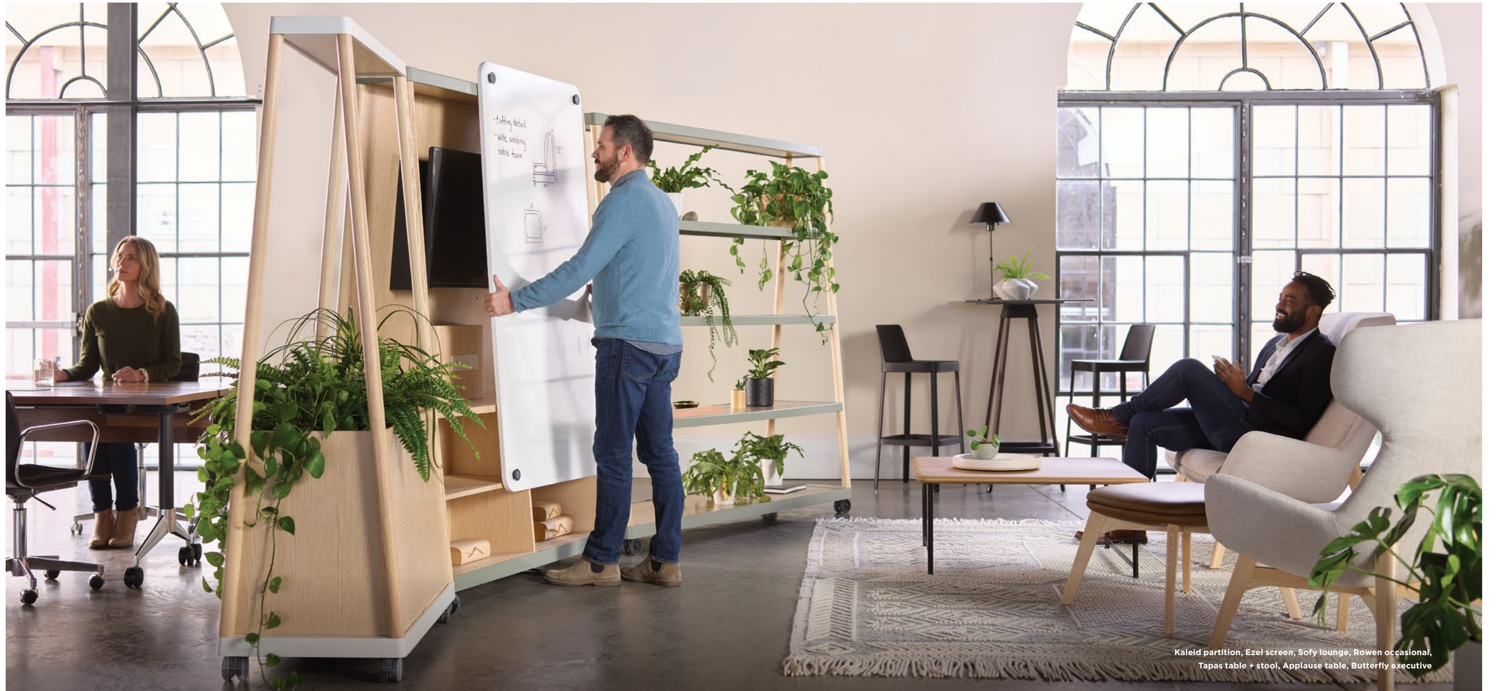
Kaleid partition, Ezel screen, Sofy lounge, Rowen occasional, Tapas table + stool, Applause table, Butterfly executive