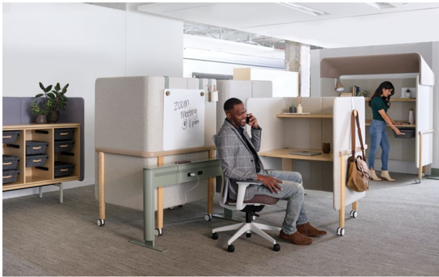
Above: Tate ottoman, The Edge lounge, Hydra planter, Obeya architectural structure, Heya workstation, Agile power distribution, Zonal task, Heya accessory, Heya storage Right: Heya storage, Binny storage