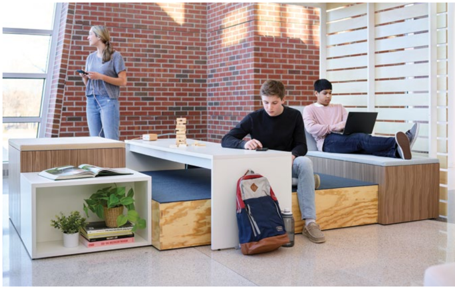
Above: Obeya architectural structure, Intermix planter, Yelly guest, Heya table, The Edge lounge Right: Gathr modular lounge, Rowen café table, Sofy guest