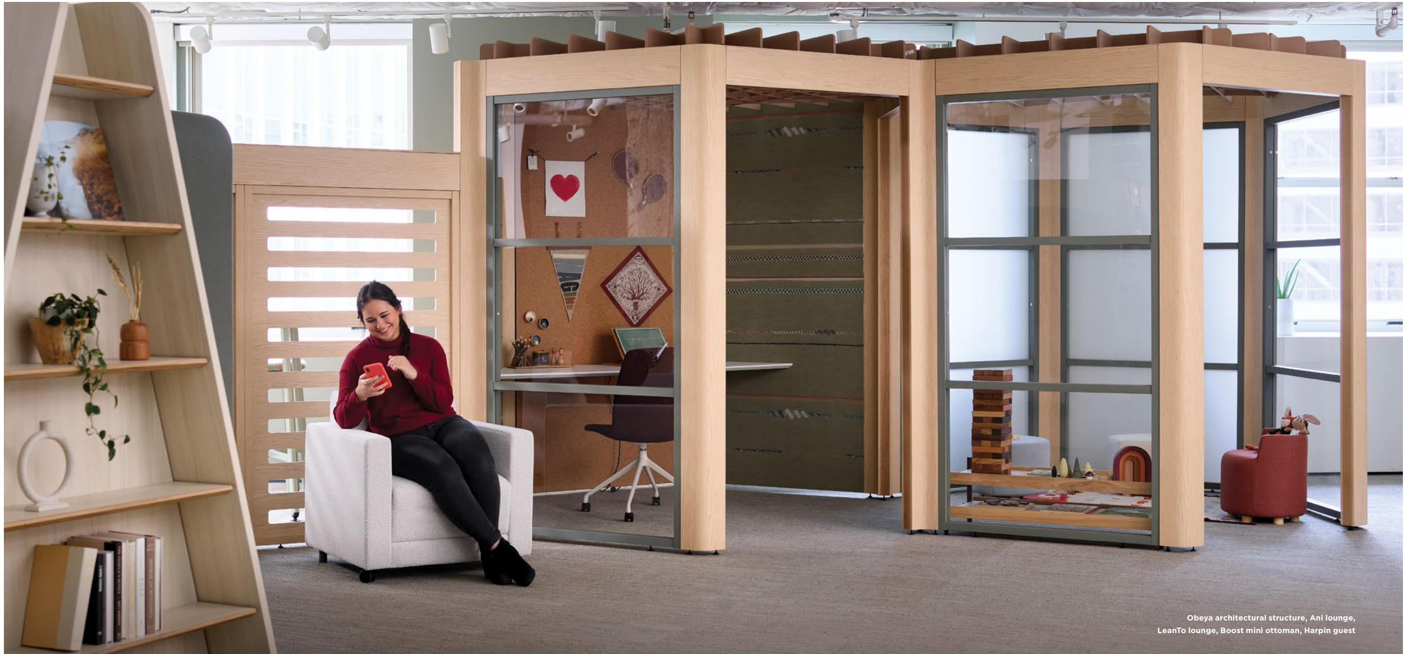
Obeya architectural structure, Ani lounge, LeanTo lounge, Boost mini ottoman, Harpin guest