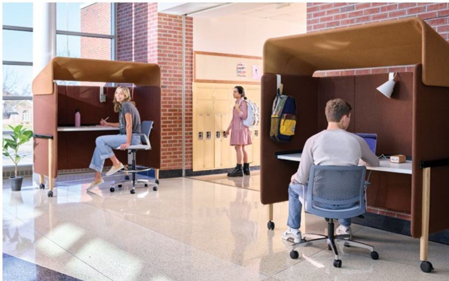
Above: Marco multi-use, Applause table, Ezel screen + caddy, Heya storage, Binny storage, Boost ottoman, Heya workstation, Genus light task + stool, Heya accessory Right: Ezel screen + caddy, Kaleid partition, Fleet stool