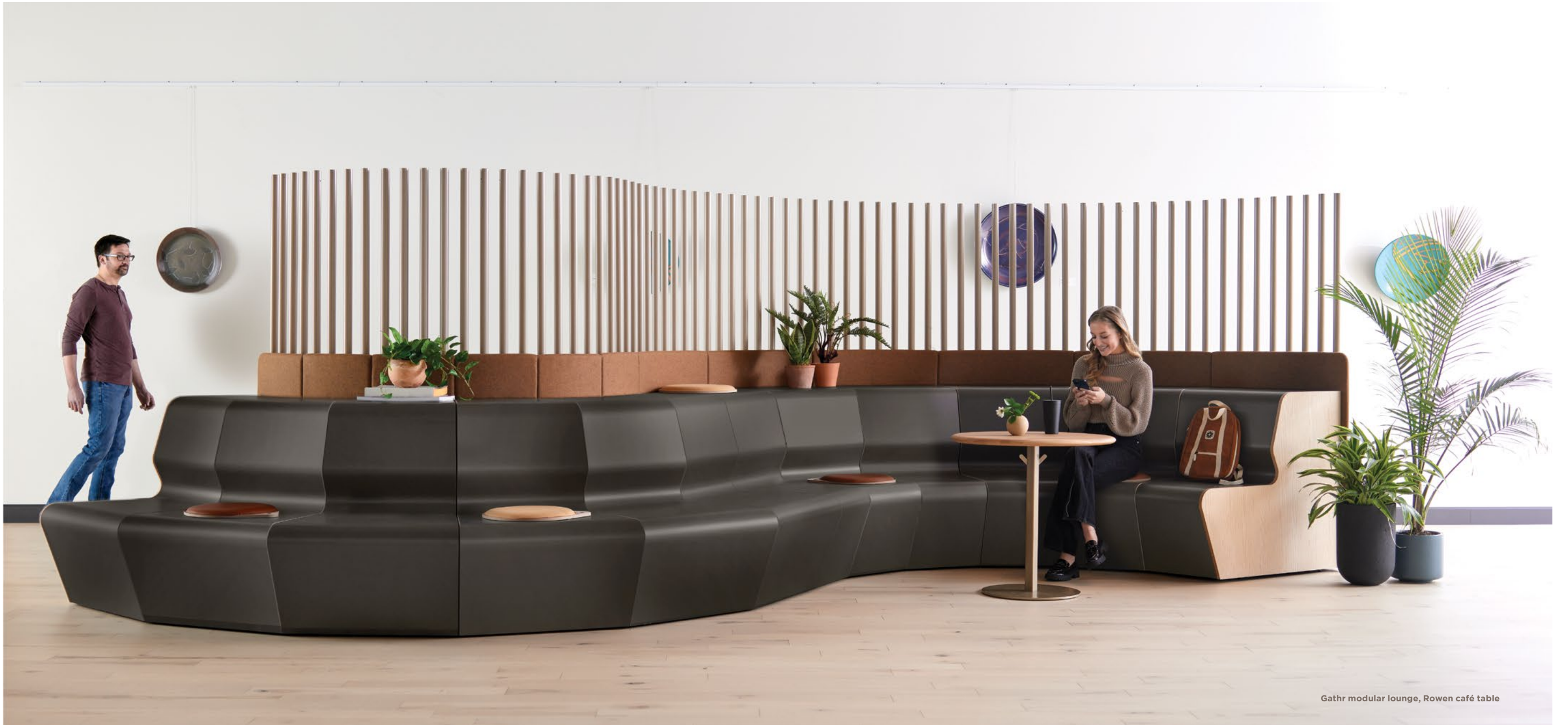
Gathr modular lounge, Rowen café table