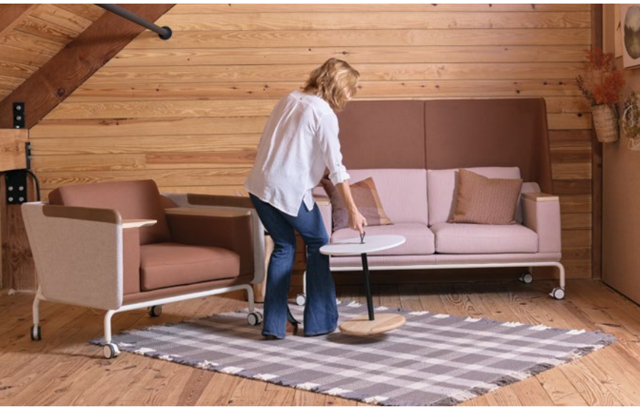
Above: Binny storage, Applause table, Marco multi-use, Heya mobile, Strap occasional Left: Fleet table, Marco multi-use