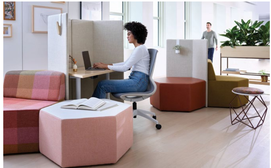
Above: Agile power distribution, Heya collaborative, Applause table, Staks casegood, Sladr task, Hex lounge, Maive stool, Vide planter, Heya accessory