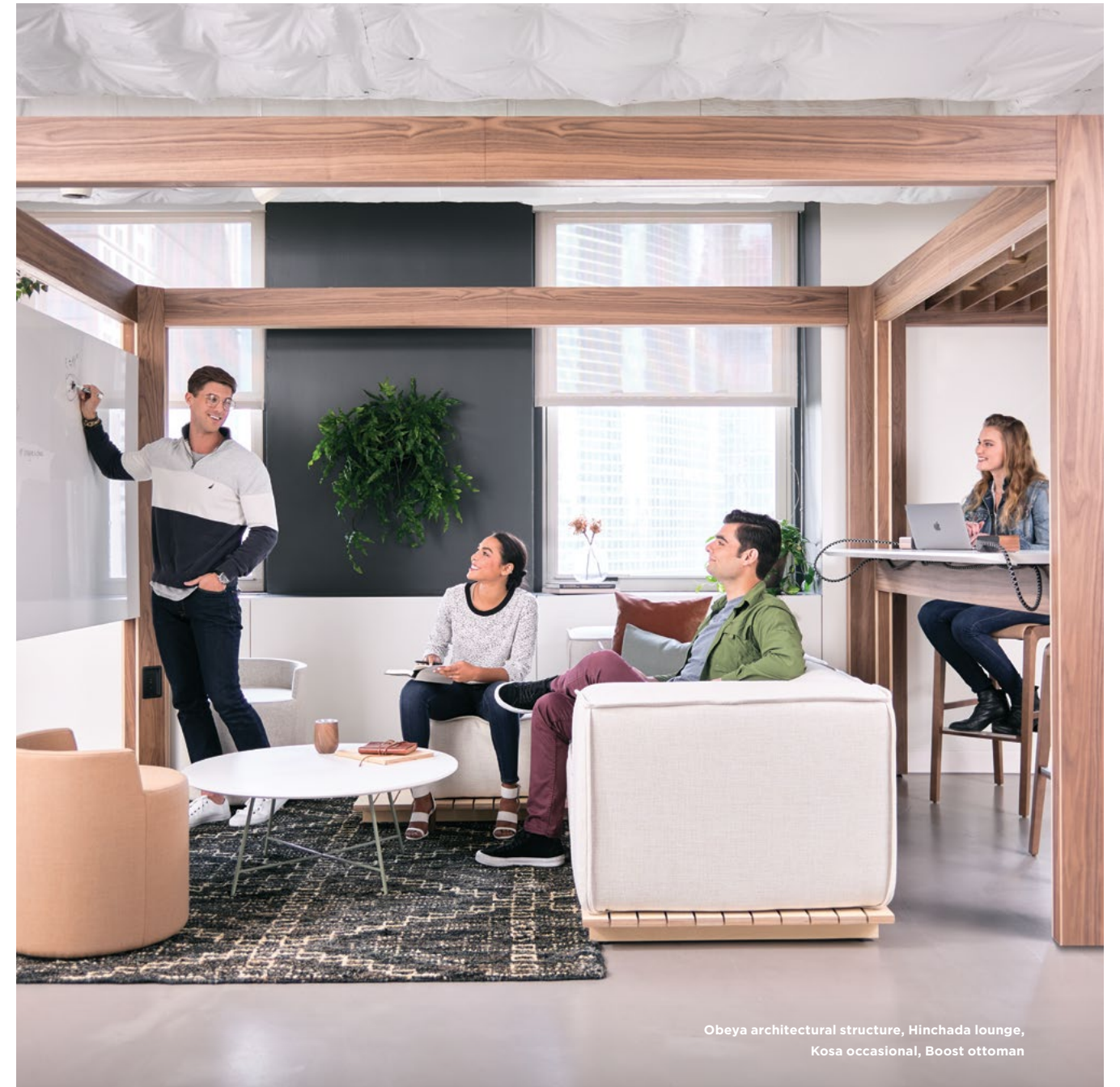
Obeya architectural structure, Hinchada lounge, Kosa occasional, Boost ottoman

There are bigger shifts that need to be made on an organizational level. We refer to this as the organizational shift between Day 1 | Day 365. As company's evaluate the behaviors of their people and the use of the settings and products from a broader perspective, there are shifts and changes that will need to be made along the way. In addition to this, as companies grow and expand, they need to be able to adapt both departmentally and sometimes throughout the full facility. With products like Obeya this allows the organization the freedom to make changes that could take months with drywall, down to a weekend's work. This translates into huge savings for the company in the long run, both externally with multiple vendors needing to be engaged, as well as internally with the employees being removed from their workspace.