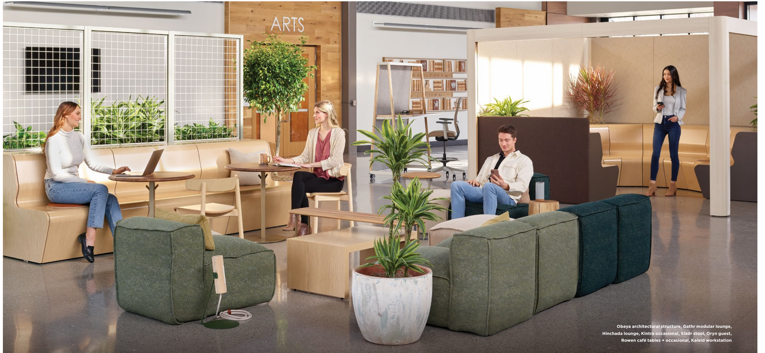
Obeya architectural structure, Gathr modular lounge, Hinchada lounge, Kintra occasional, Sladr stool, Oryn guest, Rowen café tables + occasional, Kaleid workstation