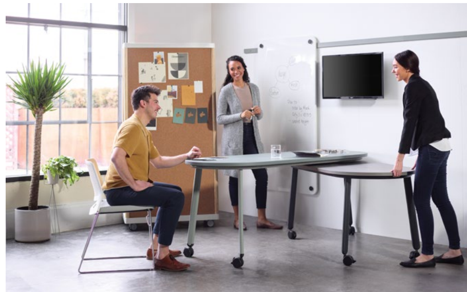
Above: Kaleid partition + planter, Sorta guest, Applause table, Genus guest, Heya mobile lounge, Fleet table, Ezel screen + rail Left: Heya workstation, Genus task