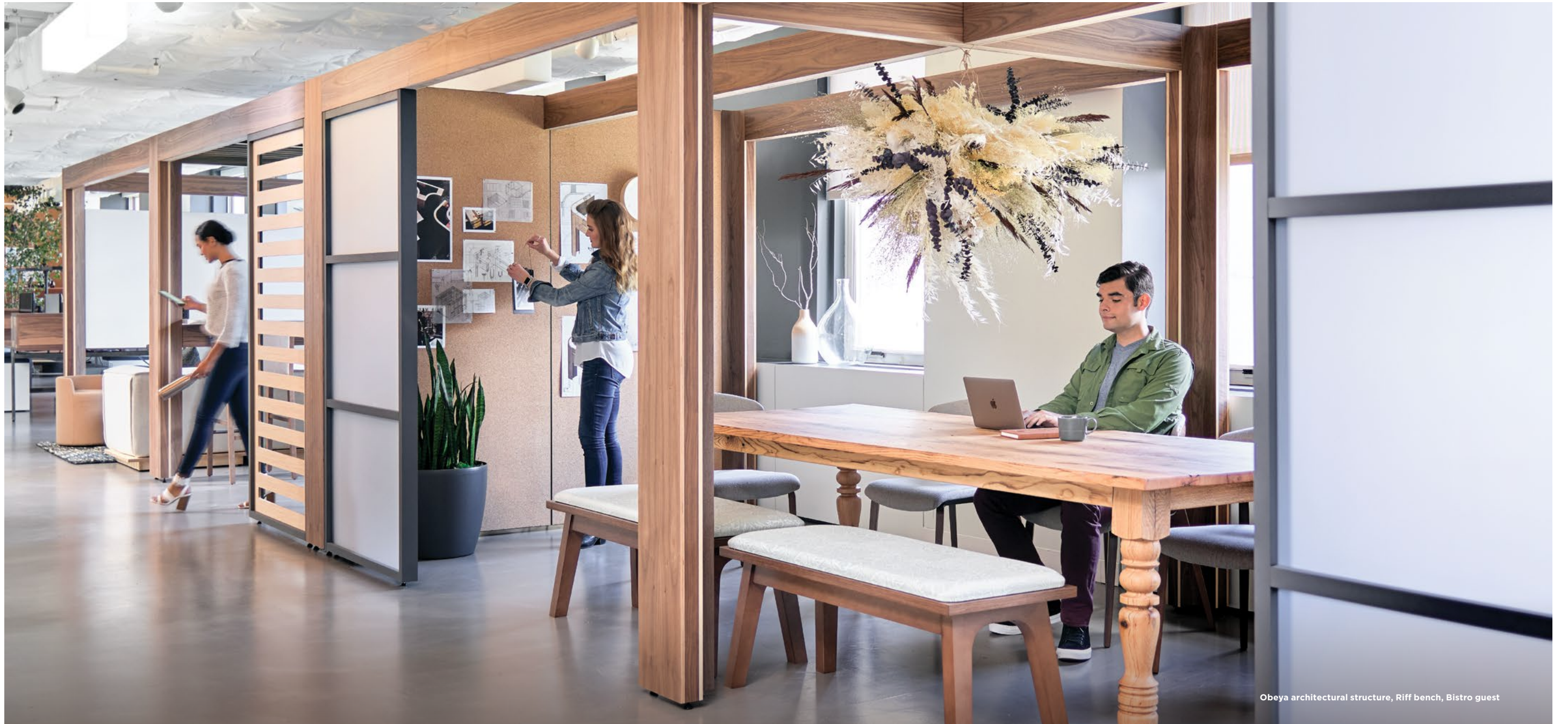
Obeya architectural structure, Riff bench, Bistro guest