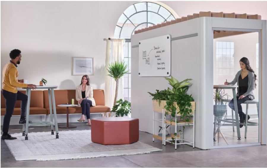
Above: Obeya architectural structure, Gathr modular seating, Rowen occasional, Hinchada lounge, Boost ottoman, Vide planter, Roo planter, Fleet table + stool, Ezel screen + rail, Coact lite modular lounge Left: Obeya architectural structure, Staks casegood, Heya table, Kasura executive, Yelly guest