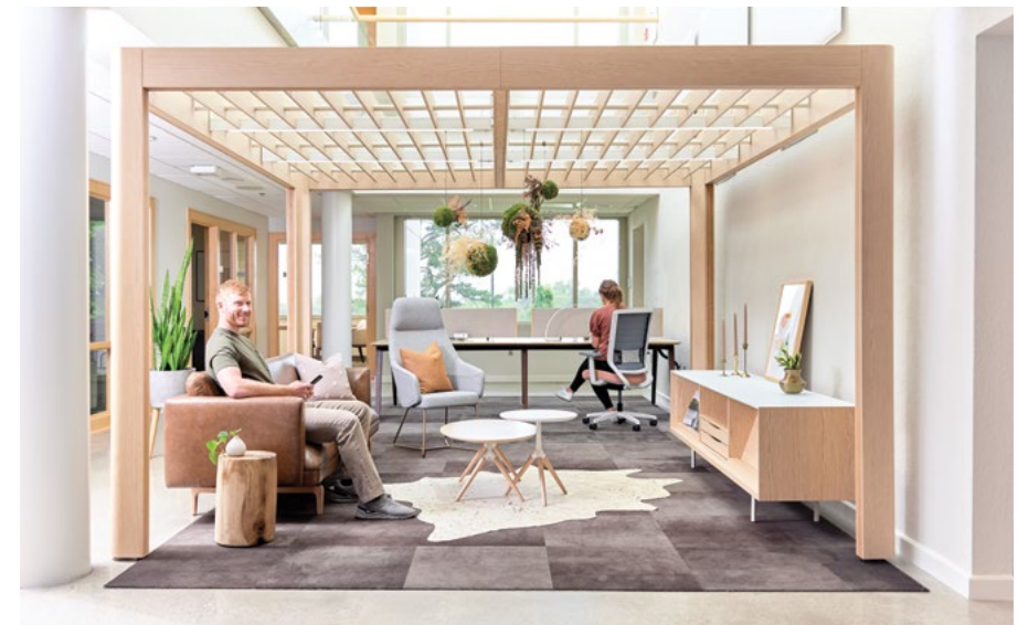
Above: Obeya architectural structure, Fleet table + stool, Roo occasional + planter, Cosima lounge, Kasura guest, Rowen credenza, Denro occasional Left: Gathr modular seating, Boost ottoman, Mya power, Coop organizer