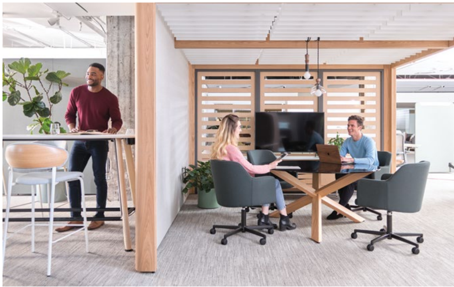
Above: Obeya architectural structure, Heya lounge + table, Kasura stool, Strap occasional, Cinque executive, Beck table, Bistro stool Right: Obeya architectural structure, Fleet table + stool, Heya storage