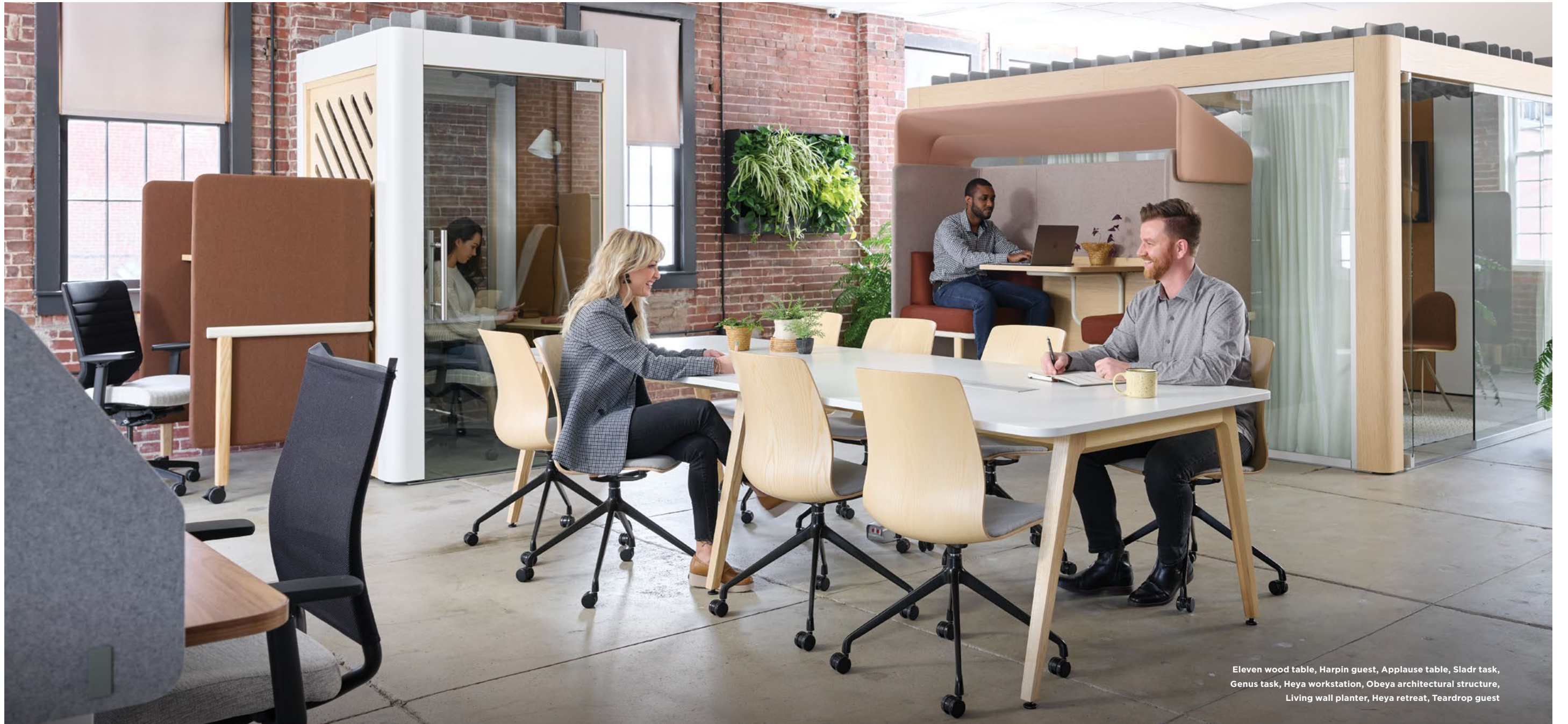
Eleven wood table, Harpin guest, Applause table, Sladr task, Genus task, Heya workstation, Obeya architectural structure, Living wall planter, Heya retreat, Teardrop guest