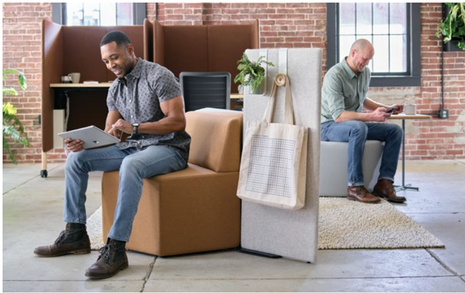
Above: Cosima lounge, Hydra planter, Roo occasional, Kasura lounge, Maive occasional, Hex lounge, Rowen pull-up table, Heya workstation Right: Kaleid partition, Fleet table + stool