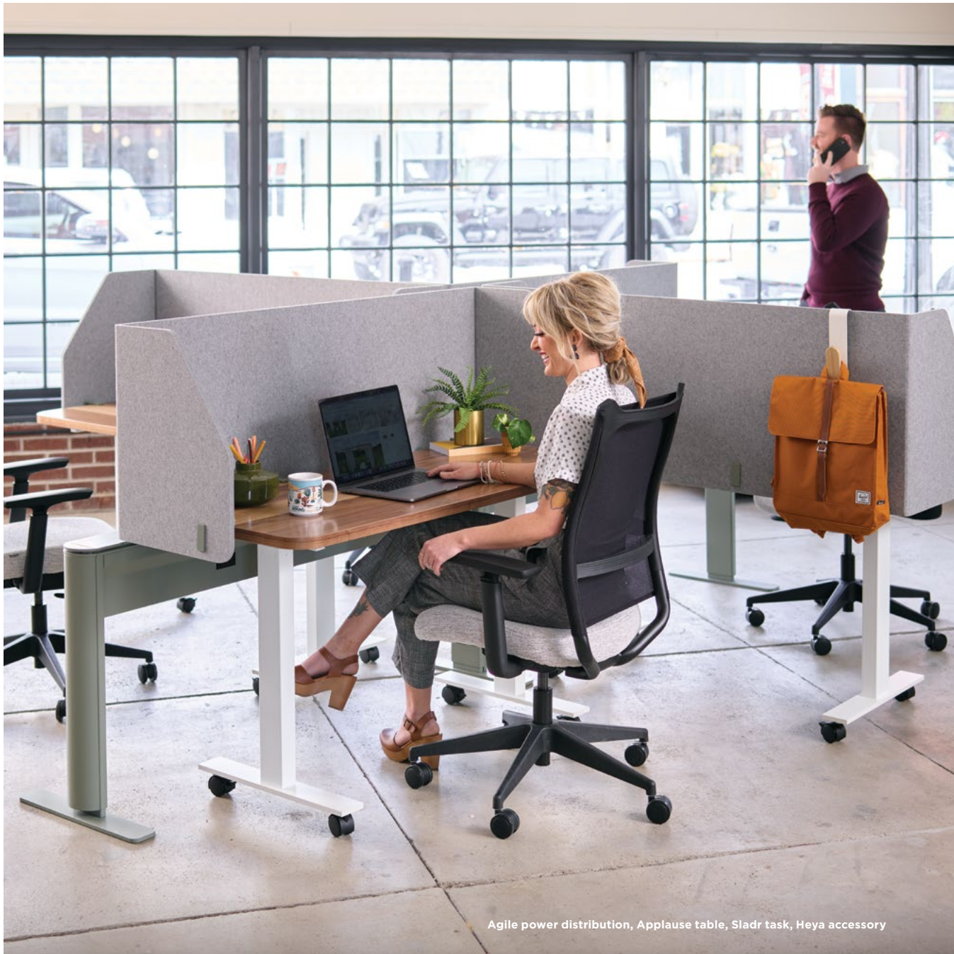
Agile power distribution, Applause table, Sladr task, Heya accessory