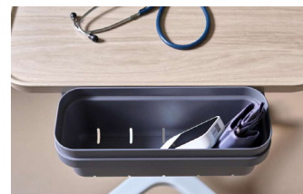
Storage bin 5.25" added to depth with bin