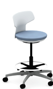
2501-B with optional footring