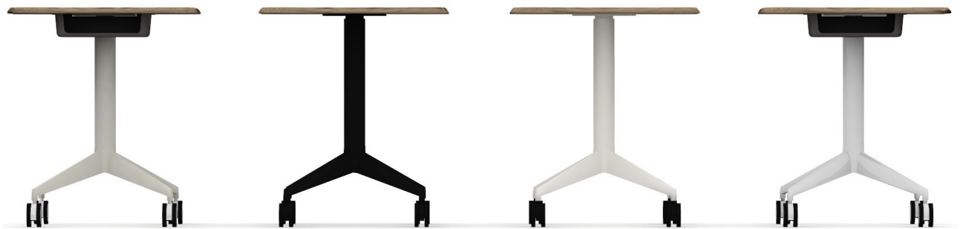
MT-2418 Chalk frame - CHLK White casters - A4H Storage cubby - STT