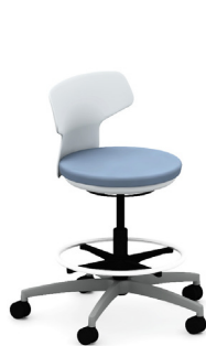
2500-B with optional footring