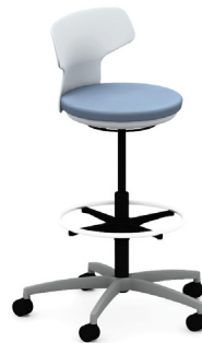
2502-B with standard footring