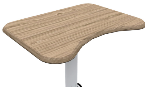
Top with no cubby option