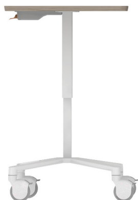
2700-3 Luster grey - MSL None - X9 Left side facing lift left - LSF