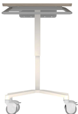
2700-3 Bone white frame - BWT Handle and storage bin - HNSB Left side facing lift left - LSF