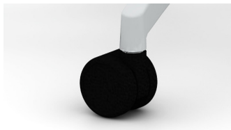
Black hard or soft wheel casters W48 (hard) / W49 (soft)