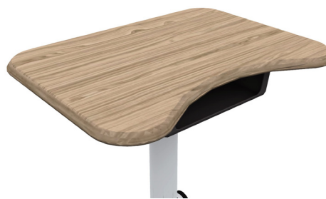
Top with cubby option