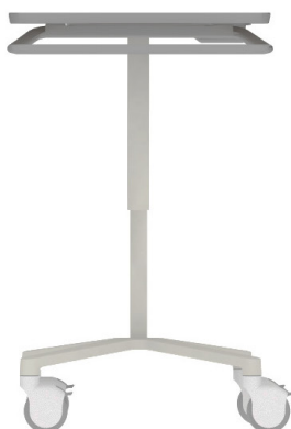
2700-3 Chalk frame - CHLK Handle - SHND Right side facing lift left - RSF