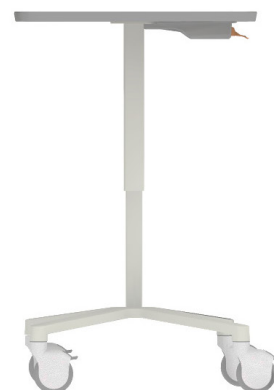
2700-3 Stone frame - STON None - X9 Right side facing lift left - RSF