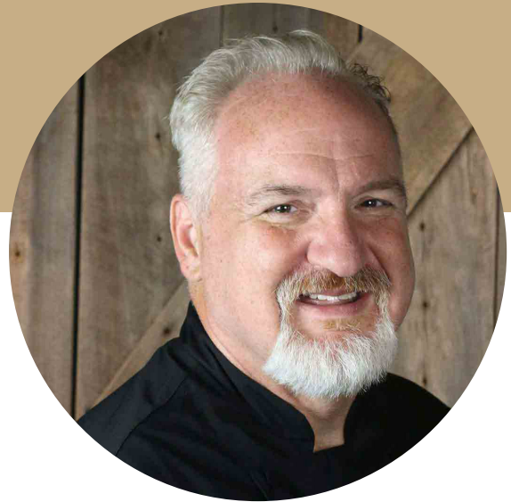
Orlando Local Chef